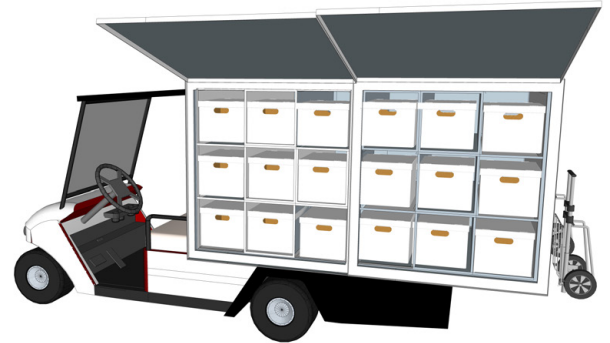
Grid system or campus serve design