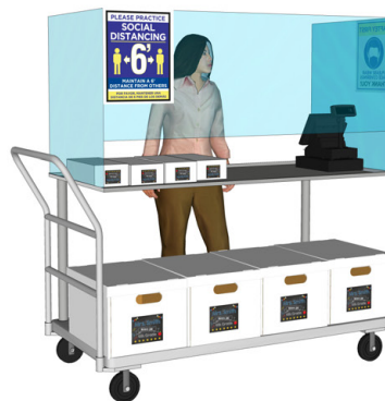
Portable POS/ Utility Cart For Food Transporting And Manual Serving

Prepare To Serve On Your Portable POS Station