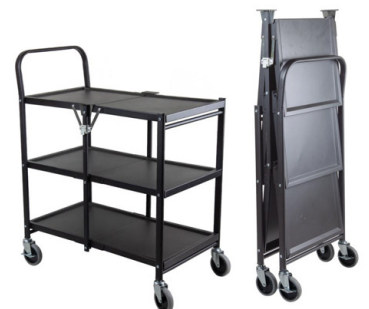
Portable-Folding Utility Cart Mounted On EV