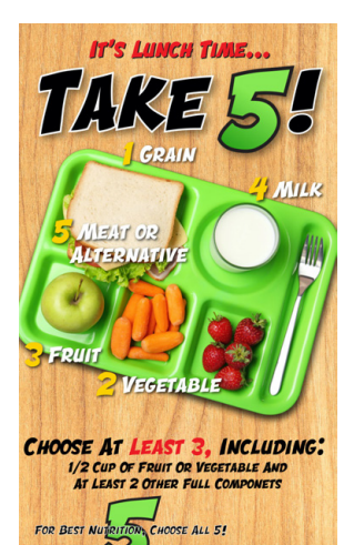
Custom Graphics Included