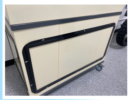
Interchangeable Graphic Panels