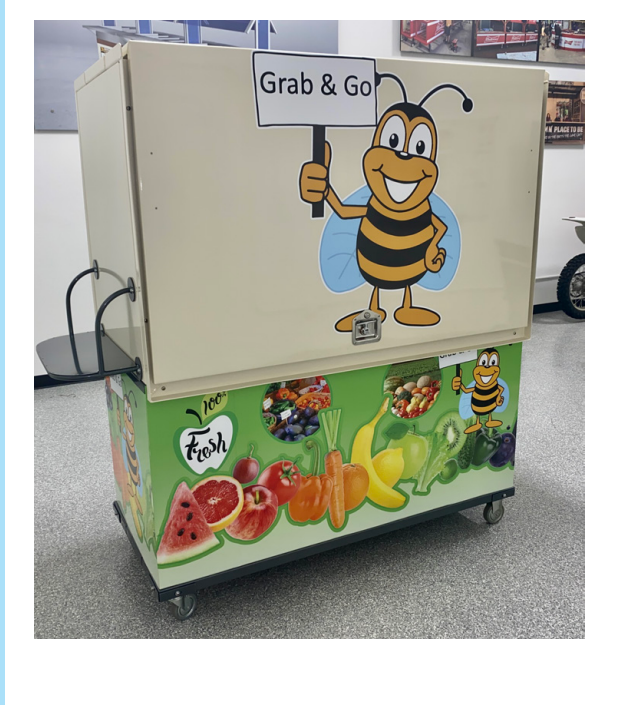
Custom Graphics Included

Battery Pack-POS Power-$805 Food Warming Bags (Includes) Electric Heating Plate-$325 Recharge Freezable Hotel Pans-$179