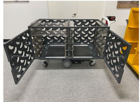
Custom Designed For Your Application