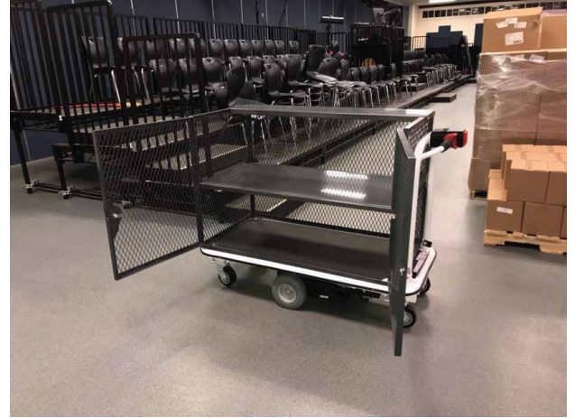
Basket Carrier Model (Shown With Optional Enclosure)