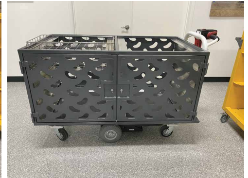
Custom Designed For Your Application