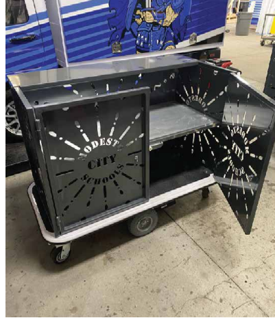
Transport Food Without Spilling

Standard Or Customized For Your Application