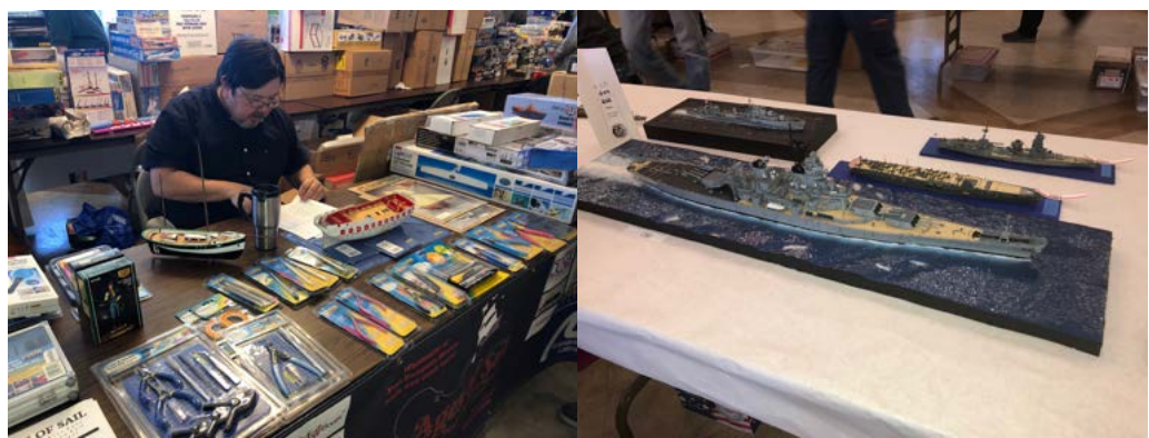
Clare Hess staffing the Ages of Sail table | Various WW 2 ship models on display

The International Plastic Modelers Society (IPMS)/Silicon Valley Scale Modelers 7th Annual Silicon Valley Classic scale modeling convention will be held on this day at Napredak Hall, 770 Montague Expwy, San Jose, CA. We have had exhibitions there annually over the last several years in conjunction with Ages of Sail and always had great fun. Here are a couple of pictures from the last convention this spring. Should you have any models you want to show off, by all means bring them.