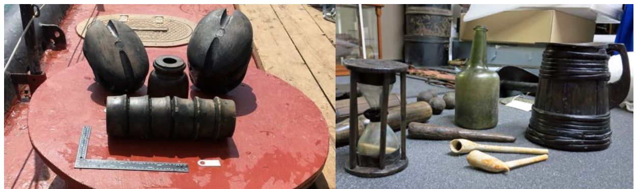
Fig. 3 and 4. Ships blocks (Left) and Sailors' effects (Right) from HMS Invincible (NMRN)