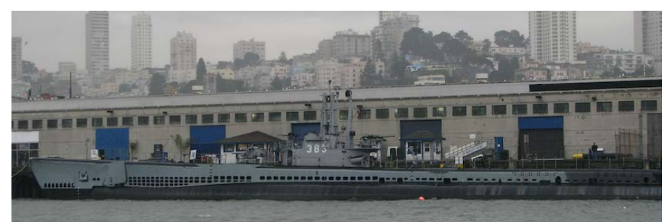
USS Pampanito in San Francisco

The USS Hornet in Alameda, which held celebrations of the 50<sup>th</sup> Anniversary of the Apollo Moon landings this past summer is another possibility. We can discuss this and other ideas at the dinner and again in the Jan 2020 meeting.