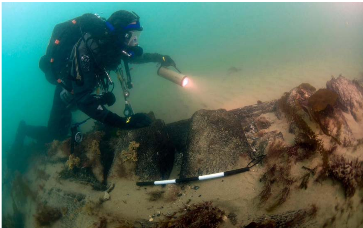
Fig. 2. Diver on the wreck of HMS Invincible