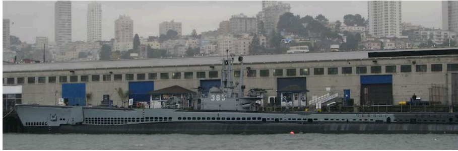
USS Pampanito in San Francisco

The USS Hornet in Alameda, which held celebrations of the 50 th Anniversary of the Apollo Moon landings this past summer is another possibility. We can discuss this and other ideas at the dinner and again in the Jan 2020 meeting.