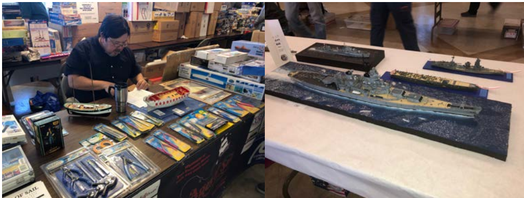
Clare Hess staffing the Ages of Sail table | Various WW 2 ship models on display

The International Plastic Modelers Society (IPMS)/Silicon Valley Scale Modelers 7th Annual Silicon Valley Classic scale modeling convention will be held on this day at Napredak Hall, 770 Montague Expwy, San Jose, CA . We have had exhibitions there annually over the last several years in conjunction with Ages of Sail and always had great fun. Here are a couple of pictures from the last convention this spring. Should you have any models you want to show off, by all means bring them.