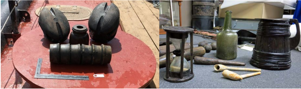
Fig. 3 and 4. Ships blocks (Left) and Sailors' effects (Right) from HMS Invincible (NMRN)