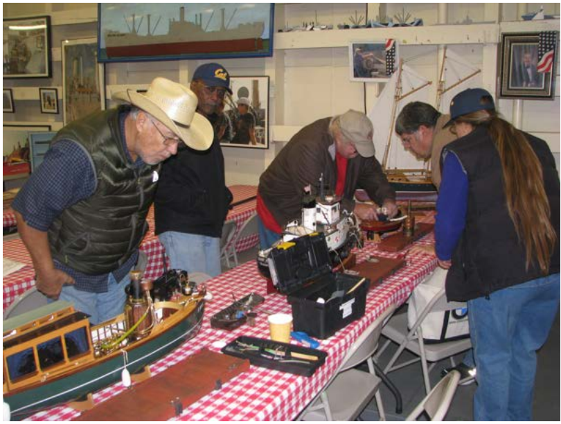
Fig. 4 The crew checking out models by the <u>Red Oak Victory Model</u> <u>Shipwrights</u> during our last visit there in 2015.

•Request for a Ship Model Restoration (Jim Rhetta)- The Club has been contacted by Peter Hurd of San Jose about an antique ship model he'd like restored. This is his description of model (Fig. 5).