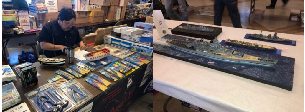
Fig. 2 Clare Hess at the Ages of Sail table

The International Plastic Modelers Society (IPMS)/Silicon Valley Scale Modelers 7th Annual Silicon Valley Classic scale modelling convention will be held on this day at Napredak Hall, 770 Montague Expwy, San Jose, CA. We have had exhibitions there annually over the last several years in conjunction with Ages of Sail and always had great fun. Here are a couple of pictures from the last convention last spring (Fig. 2 and 3).