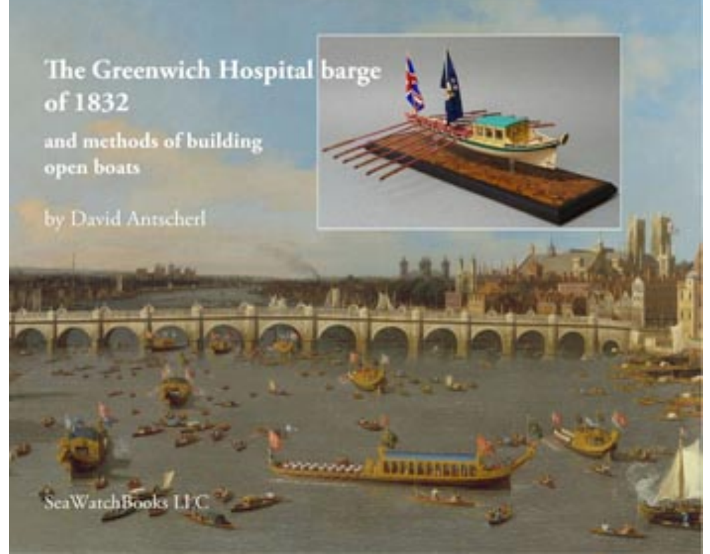
Fig. 11.

Finally, Seawatch Books (https://www.seawatchbooks.com) offers what looks like a superb reference on plank-on-frame decorated open boats with this book on the <u>Greenwich Hospital Barge of 1832</u> (Fig. 11 and 12) by David Antscherl. for $45. The techniques expounded in here are said to apply both to lapstrake (clinker) and carvel construction.