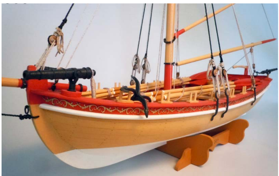
Fig. 8. 1/24 Longboat (Model Expo)

https://modelexpo-online.com/Model-Shipways-MS1460-18th-Century-Armed-Longboat-124-Scale--Laser-Cut-Wood-Metal-Photo-etched-Brass-Kit_p_3218.html