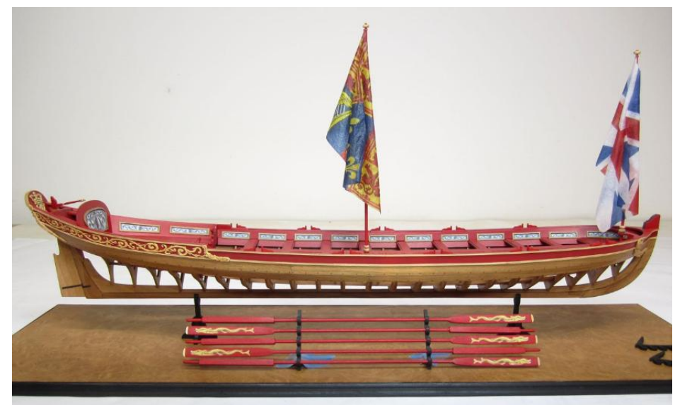
Fig. 10. Queen Anne Style Royal Barge (Syren Models)

https://www.syrenshipmodelcompany.com/royal-barge-kit.php