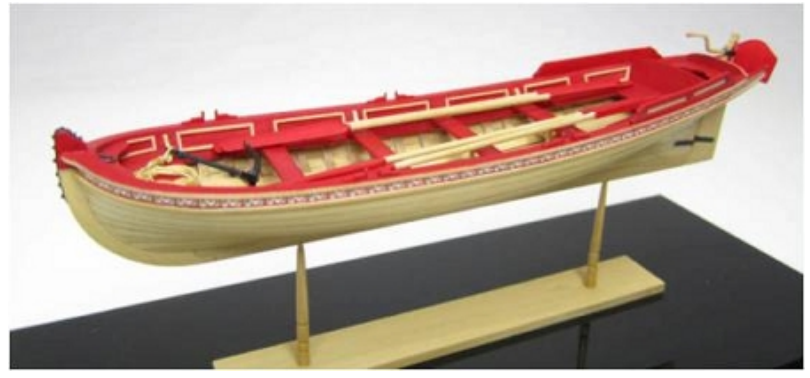
Fig. 9. English Pinnace (Model Expo)

https://modelexpo-online.com/Model-Shipways-21ft-English-Pinnace-Wood-Metal-Model-Ship-Kit-124-Scale--MS1458_p_959.html