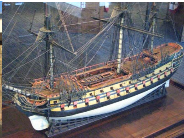
Fig. 4 Model of HMS Mars