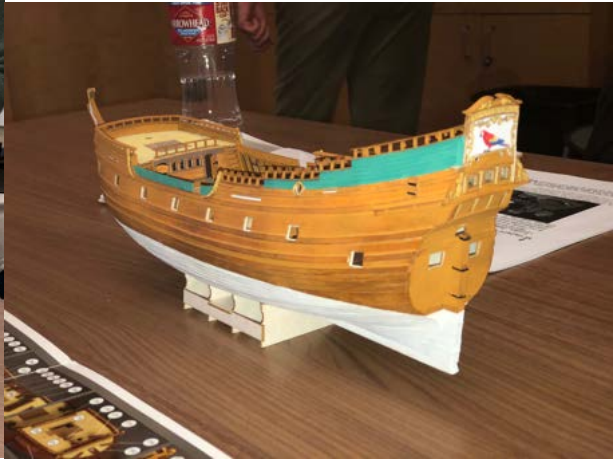
Fig. 11 Papagojen stern decorations by George Sloup