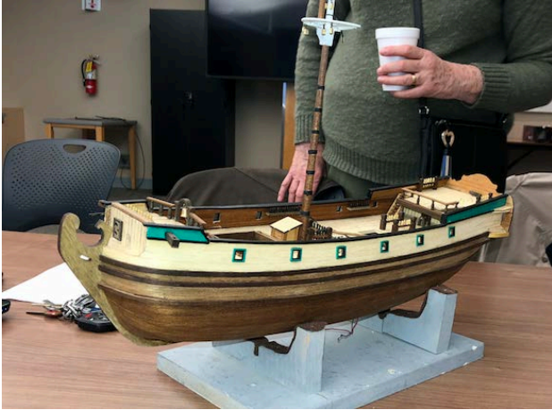
Fig. 10 Bomb Ketch, La Candelaria OcCre model