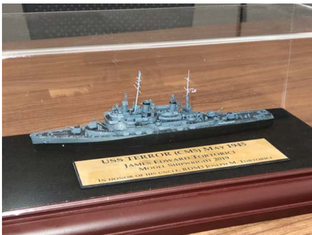
1/700 completed USS Terror by Jim Tottorici Jim's uncle served aboard her In WW 2