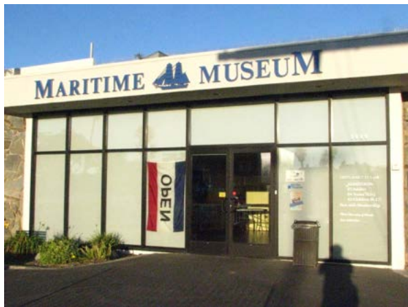
Fig. 3 Channel Islands Maritime Museum

Our late fellow member, Ed Von der Porten and Ken Lum visited there while returning from Encinada, Mexico in 2013 and found numerous very expertly done ship models to enjoy looking at along with a remarkable collection of marine art, some being originals by the Van de Veldes in the 17 th Century. This one might be worth a SBMS caravan to come down together! Here are some photos from our previous visit (Fig. 3 and 4). More details to come.