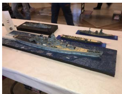
Fig. 2 Various WW 2 ship models