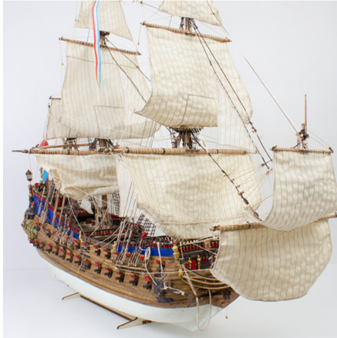
Fig. 10 De Zeven Provinciën , Flagship of Admiral Michiel de Ruyter, 1665

Of course, there are other model kits of Dutch 17 th Century ships manufactured by other model companies. For example, there are the ever popular Dutch Statenjacht kits offered by Dusek and Woody Joe (Charles Royal Yacht) and the Half Moon of Henry Hudson also from Woody Joe just to name a few. But the Kolderstok offerings certainly are unique and are all available from Ages of Sail .