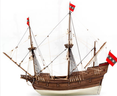
Fig. 9 Northeast Passage (north of Siberia) Exploration Ship of Willem Barentsz 1594