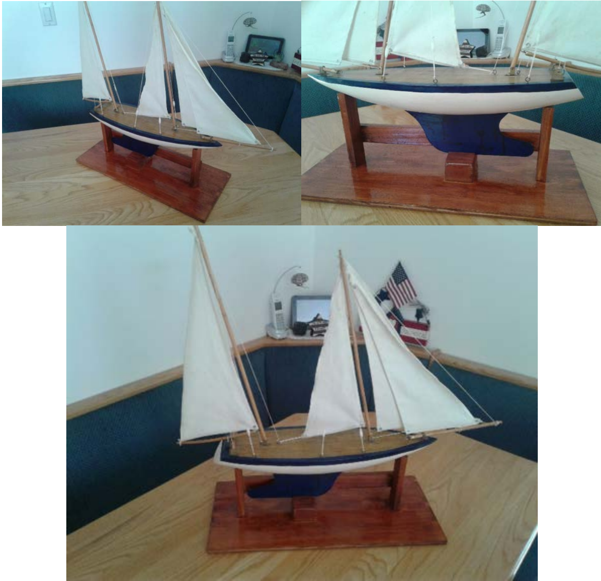
Fig. 18. Restored racing sloop