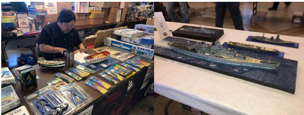
Fig. 2 Clare Hess at the Ages of Sail table Fig. 3 Various WW 2 ship models on display

The International Plastic Modelers Society (IPMS)/Silicon Valley Scale Modelers 7th Annual Silicon Valley Classic scale modelling convention has been tentatively rescheduled for this day and time at Napredak Hall, 770 Montague Expwy, San Jose, CA . We have had exhibitions there annually over the last several years in conjunction with Ages of Sail and always had great fun. Here are a couple of pictures from the last convention last spring (Fig. 2 and 3).