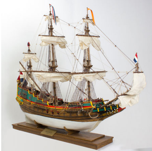
Fig. 6 VOC Retourship Batavia , 1628

The company offers 5 kits to date all pictured below: