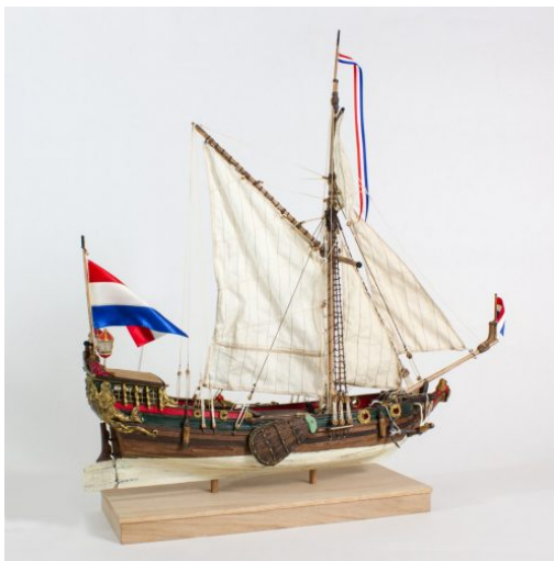
Fig. 8 Statenjacht of Willem Barentsz, 1594