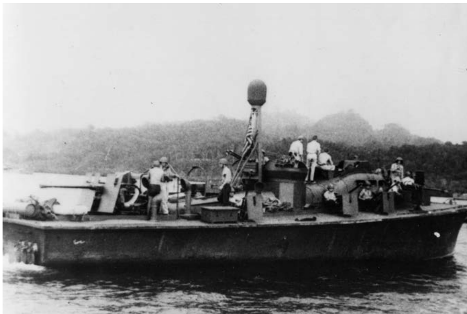
Fig. 4 PT-59 seen here while in U.S. Navy service in the Solomon Islands

Kennedy was given command of another PT boat, the PT-59 (Fig. 4), which he and his crew used to attack Japanese barges and shore batteries, and rescued 10 stranded Marines in the northern Solomon Islands, one of whom died in Kennedy's bunk.