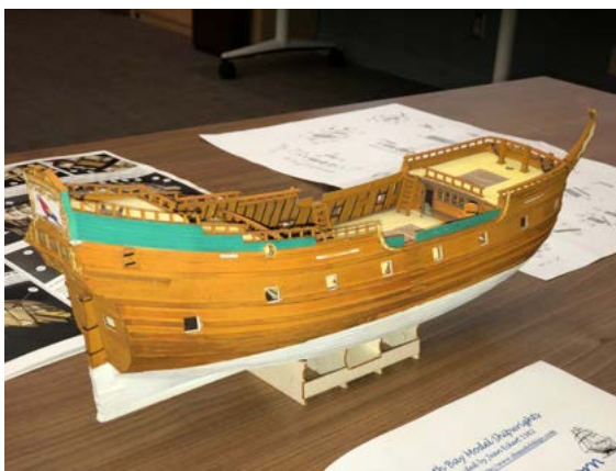
Fig 5. George Sloup’s paper model of the Papegojan

Many have been admiring George Sloup’s Shipyard paper model of the Papegojan , a Dutch 17th century pinnace (Fig.5) that he has been working on for several months.