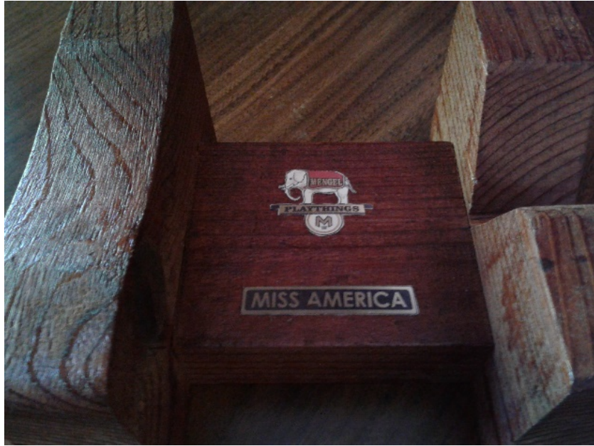
Fig. 16. New Ship Model Stand

I wanted to refinish the wood and install a new ship name and logo, but the customer said this was a no-no and would take away from the value of the toy motor boat in its original condition. I did clean the wood and removed the tarnish from the brass.