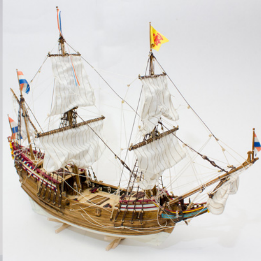
Fig. 7 Exploration Ship, the Pinace Duyfken , 1595