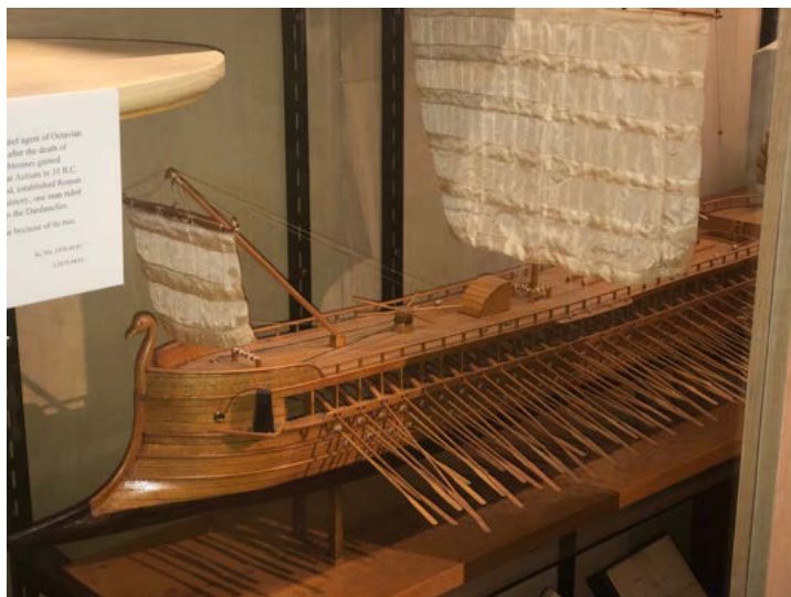
Fig. 1 Roman Trireme model at the Naval War College, Newport, Rhode Island (Ken Lum)