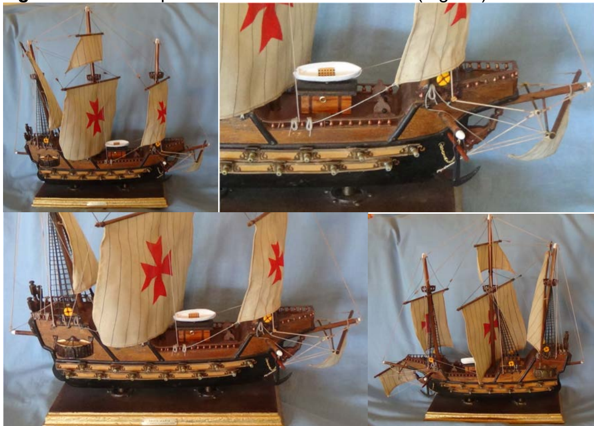
Fig. 14. Completed restoration of a decorative Santa Maria

Pictures of the damaged Santa Maria model can be seen in last month's Foghorn . Here are pictures of the restored model (Fig. 14).