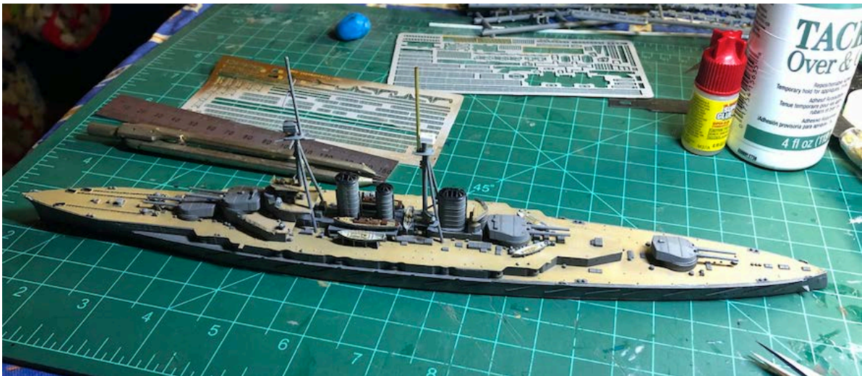
Fig. 11 Jacob Cohn's 1/700 model of IJN Kirishima by Kajika models in her 1915 configuration.