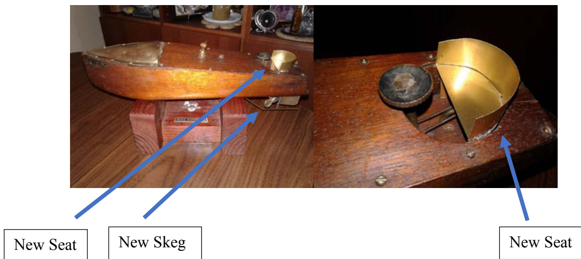
Fig. 15. Miss America toy power boat with new parts.

The first was actually a toy power boat called the " Miss America ". It was built around 1920 with a solid wood hull and a wind-up propeller (fig. 15). A similar " Miss America " has been featured on American Pickers . My task was to build a replacement brass seat and skeg. I looked through available pictures to best recreate the seat and skeg.