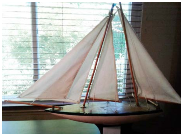
Fig. 17. Racing sloop model in original condition

The next ship model restoration was a generic racing sloop (Fig. 17) with a detached bow spirit, detached rigging on all masts, and chipped paint. I also built a stand for the ship model.