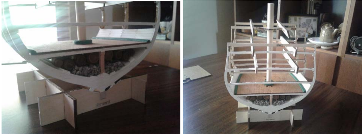
Fig. 19. Cross section model of USS Constitution in progress