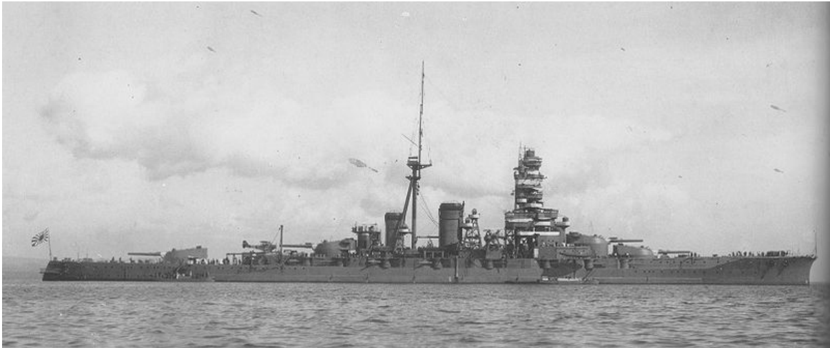
Fig. 13. Kirishima in 1937 after modification into a battleship