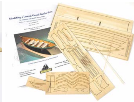
Fig.10. Lowell Grand Banks fishing dory out of the box (Model Shipways)

The other model is of a Norwegian Sailing Pram (Fig. 11) at 1/12 scale offered at $64.99.