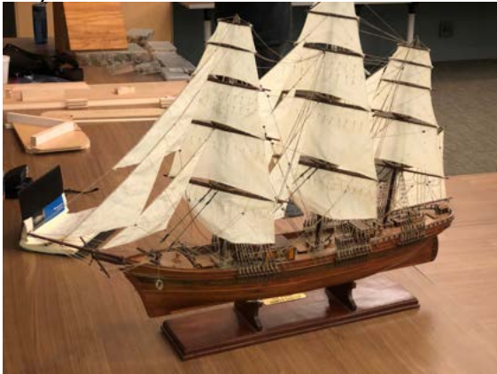
Fig. 12. Robert Miguel's Flying Cloud model now repaired

• Walt Hlavacek has completed a display case (Fig. 13) for a Flying Cloud model brought in during the spring for repair by Robert Miguel (Fig. 12).