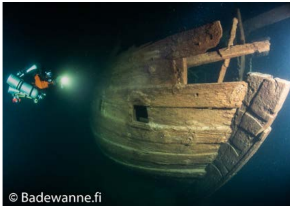
Fig. 5. Round stern on port side.

Divers from the Finnish diving organization, Badewanne , have discovered a nearly intact wreck of a 17 th Century Dutch fluyt (Fig. 5, 6, and 7) at a depth of about 280 ft. in the Gulf of Finland between Finland and Estonia. The conditions of low salinity, low temperature and low light have enabled exceptional preservation of the wooden wreck, and prevented ship worms from destroying the wood. Only slight damage was found due to trawler nets.