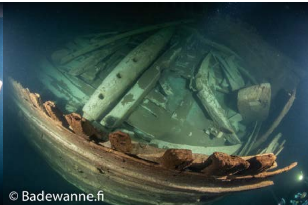
Fig. 6. Windlass seen from the starboard bow quarter.