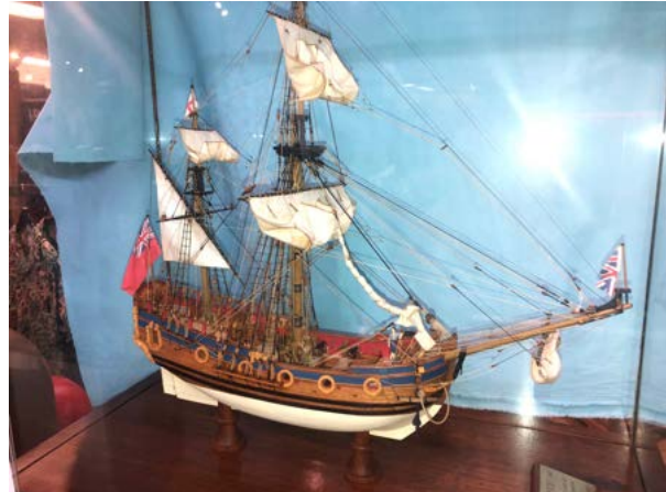
Fig. 3. Exploration ketch, Nonsuch of 1650.