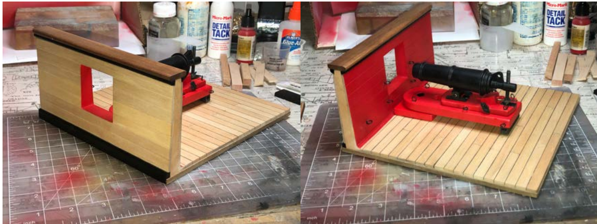
Fig. 15a-b. Ken Lum's nearly completed Mantua kit of an English carronade . Only the deck fittings and maneuvering ropes need to be installed.

• Ken Lum is nearly finishing up his British carronade model (Fig. 15a-b). The scratch-built gunnel platform is made from maple, basswood, walnut and Macassar ebony. The Mantua kit gun barrel and some deck fittings were used. The diorama portrays the location of a 32 lb. carronade on a quarter deck location where carronades were frequently used. Contemporary Admiralty ship models often show these gun ports to be without lids so I did not install one.