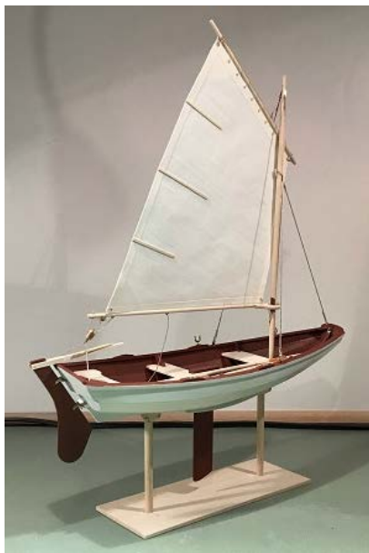
Fig. 11. Norwegian Sailing Pram (Model Shipways)

The other model is of a Norwegian Sailing Pram (Fig. 11) at 1/12 scale offered at $64.99.