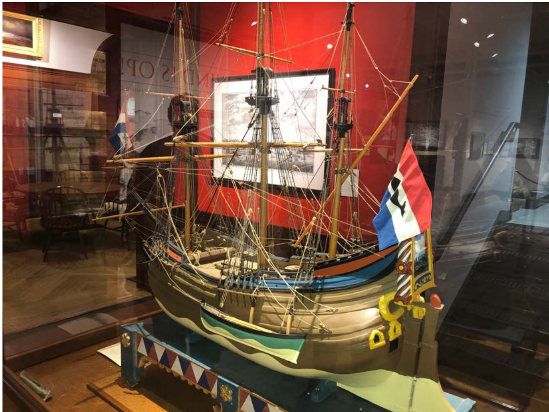
Fig. 8. Dutch Fluyt model at the New Bedford Whaling Museum portrayed here as an early whaling ship.

Fluyts (Fig. 8) were built with only cargo carrying trade in mind and were not convertible to warships. Thus, they were cheaper to build and required fewer crew to operate. It was the commercial activities of these ships that provided the economic basis of the Dutch Golden Age in the 17 th Century.