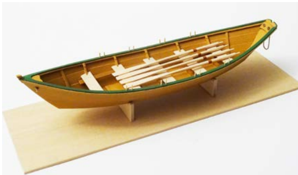
Fig. 9. Completed Lowell Grand Banks fishing dory (Model Shipways)

Model Shipways has introduced two new kits for beginners designed by the famed Canadian ship modeler, David Antscherl . One is of a Lowell Grand Banks fishing dory (Fig. 9 and 10) at 1/24 scale selling for $34.99.