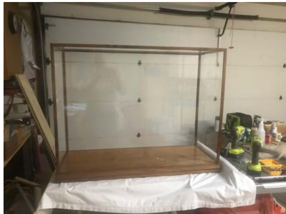
Fig. 13. Walt Hlavacek's finished display case for the Flying Cloud model

• Jacob Cohn is now almost finished with his 1/700 scale model of the Imperial Japanese pre-dreadnought battleship, Mikasa (Fig. 14). Only the rigging in the masts remain to be done. Marvelous detail and outstandingly realistic ocean surface!