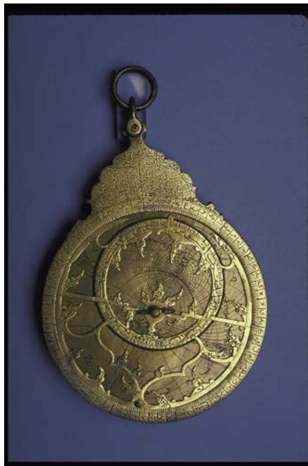
Fig. 4. Persian Planispheric Astrolabe (circ. 1864) (Smithsonian)

Jim Tortorici will give a presentation about a type of early astronomical and navigational instrument known as an Astrolabe ( Fig. 4 ).