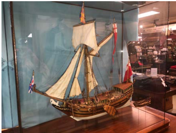
Fig. 2. Yacht Mary of 1660

In 1991, she entered her model of the Dutch Yacht, Mary , of 1660 (Fig. 2) in a contest at the Mariiner's Museum in Newport News, VA, being the first woman ever to do so. She received a Bronze Medal for that entry. By 2000, she had entered her extraordinary model of the Nonsuch (Fig. 3) and was awarded a Gold!