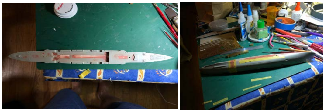
Fig. 12. Work begins on the hull.

The first part of the project is to modify the ship's deck removing details that will be replaced by the photo-etch parts. Plasticard is used to fill the voids and then putty is used to make the surface even.