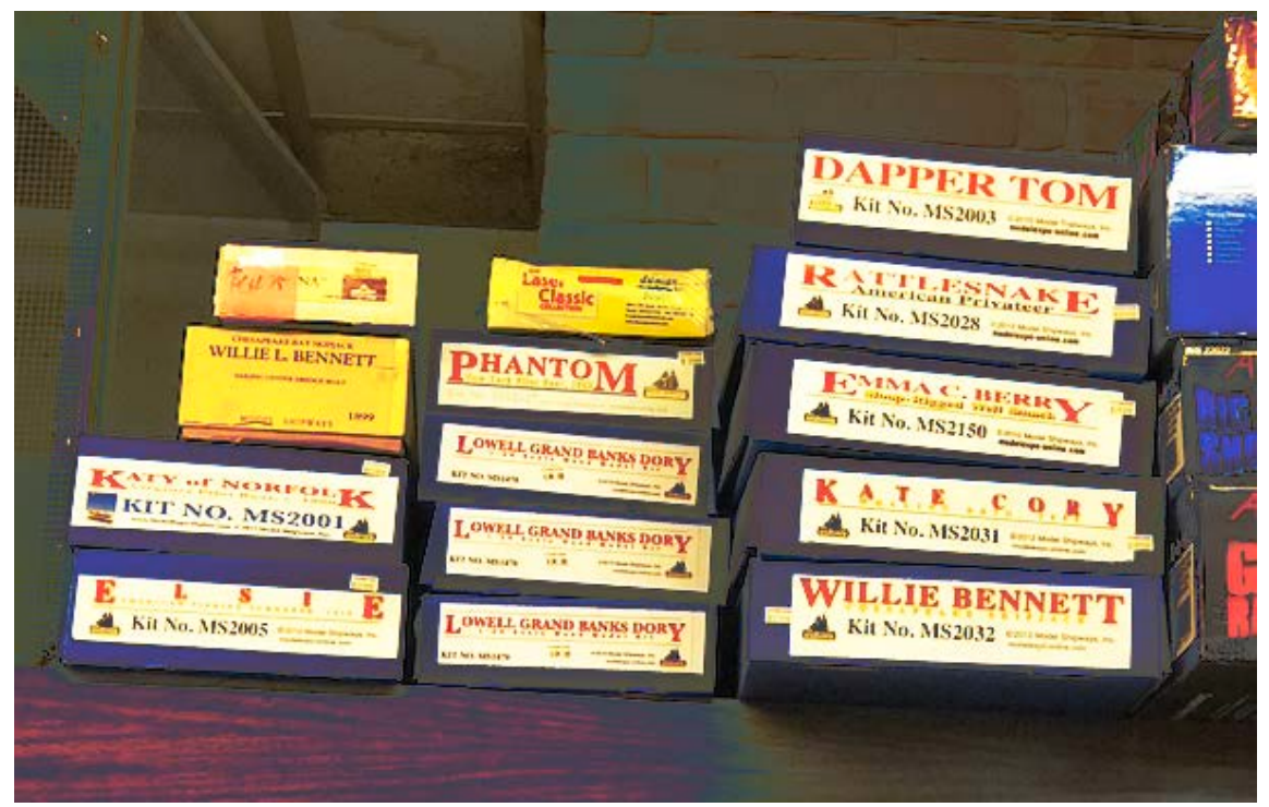
Fig. 3. Model Shipways kits at J & M Hobby House, San Carlos

For ship modelers, there is a nice collection of Model Shipways kits (Fig. 3) and fittings as well as RC boats for those looking for something that offers more action.