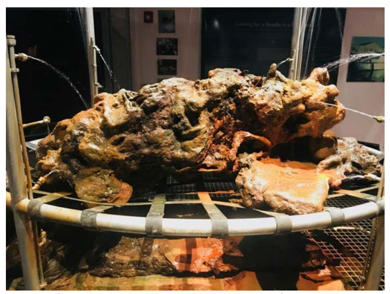
Fig. 5. Concretion containing remains of Whydah crew (Whydah Pirate Museum)

The skeletal remains have been found in large concretions now undergoing detailed examination (Fig. 5). Most compelling is a ship's bell with the name of the ship on it which definitively identifies the wreck (Fig. 6).