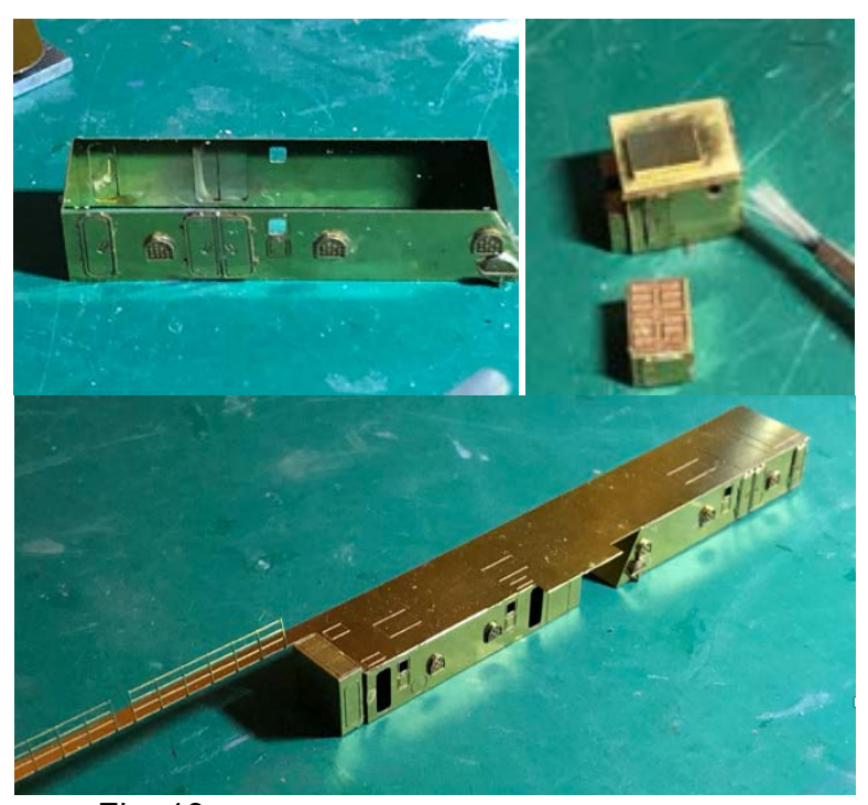
Fig. 13. Assembly of the deck structures begins.

The first part of the project is to modify the ship's deck removing details that will be replaced by the photo-etch parts. Plasticard is used to fill the voids and then putty is used to make the surface even.