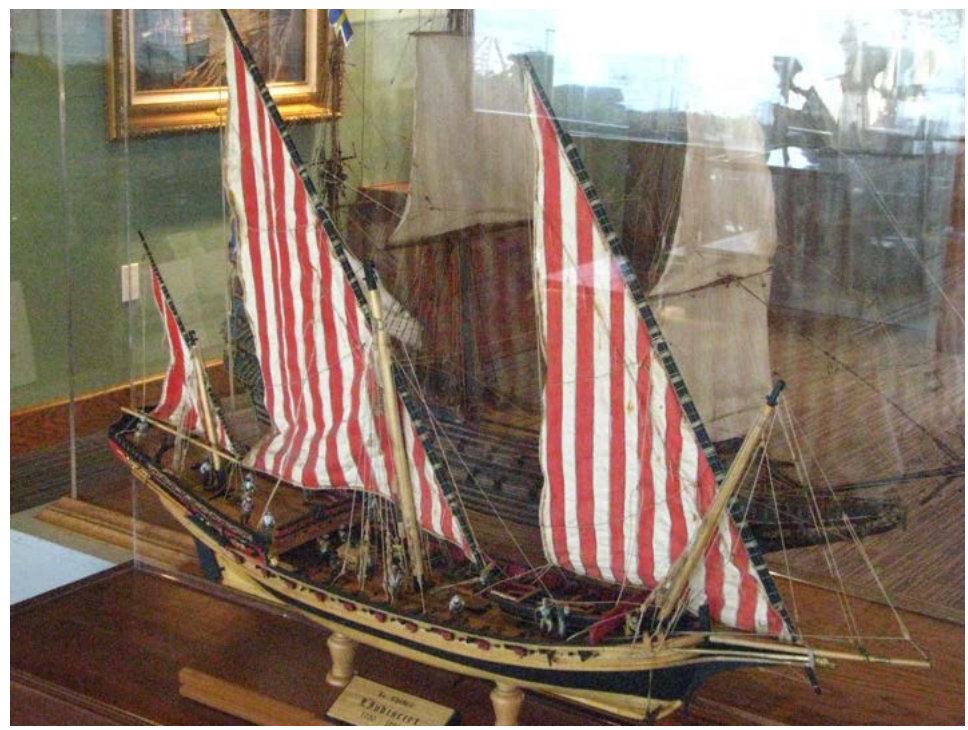
Fig. 1. Xebec model in the Channel Islands Maritime Museum

and there are several very nice video tours of the museum on YouTube as well. More news about this event can be found at the NRG website.