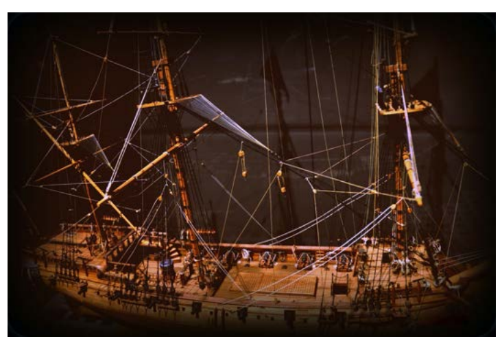
Fig. 4. Model of the Whydah (Whydah Pirate Museum)

The skeletons of six individuals thought to be from the wreck of the pirate ship, Whydah Gally (Fig. 4) were found off the coast of Cape Cod, MA. This shipwreck is said to be the only verified pirate shipwreck in the world and is associated with famed pirate, Samuel "Black Sam" Bellamy known as the 'Robin Hood of the Sea' .