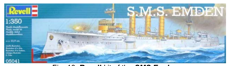
Fig. 10. Revell kit of the SMS Emden

Müller then took Emden to raid the Cocos Islands , where he landed a contingent of sailors to destroy British facilities. There, Emden was attacked by the Australian cruiser HMAS Sydney on 9 November 1914. The more powerful Australian ship quickly inflicted serious damage and forced Müller to run his ship aground to avoid sinking. Out of a crew of 376, 133 were killed in the battle.