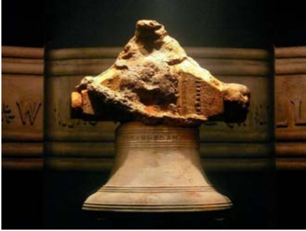
Fig. 6. Left-artifacts from the Whydah wreck. Right-Ship's bell with ship's name.

All in all, Bellamy and his crew had captured over 50 ships in their pirate career resulting in an enormous amount of booty being originally stored in the Whydah . Enough has now been recovered that a museum called the Whydah Pirate Museum was built and opened on Cape Cod in 2016 to display what has been found and provide a laboratory for extracting and conserving the artifacts (Fig. 7).