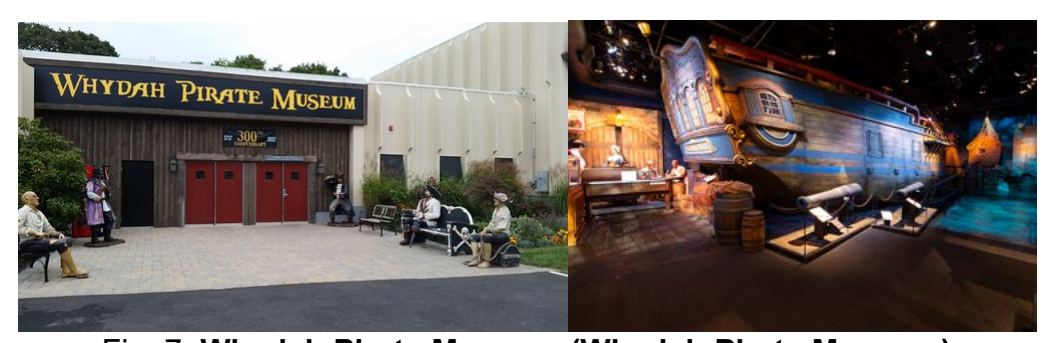
Fig. 7. Whydah Pirate Museum (Whydah Pirate Museum)

All in all, Bellamy and his crew had captured over 50 ships in their pirate career resulting in an enormous amount of booty being originally stored in the Whydah . Enough has now been recovered that a museum called the Whydah Pirate Museum was built and opened on Cape Cod in 2016 to display what has been found and provide a laboratory for extracting and conserving the artifacts (Fig. 7).