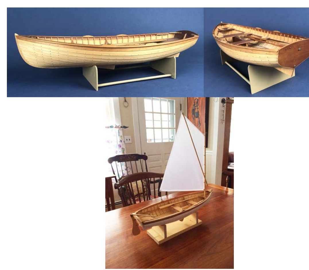
Fig. 8. Catspaw Dinghy model kit