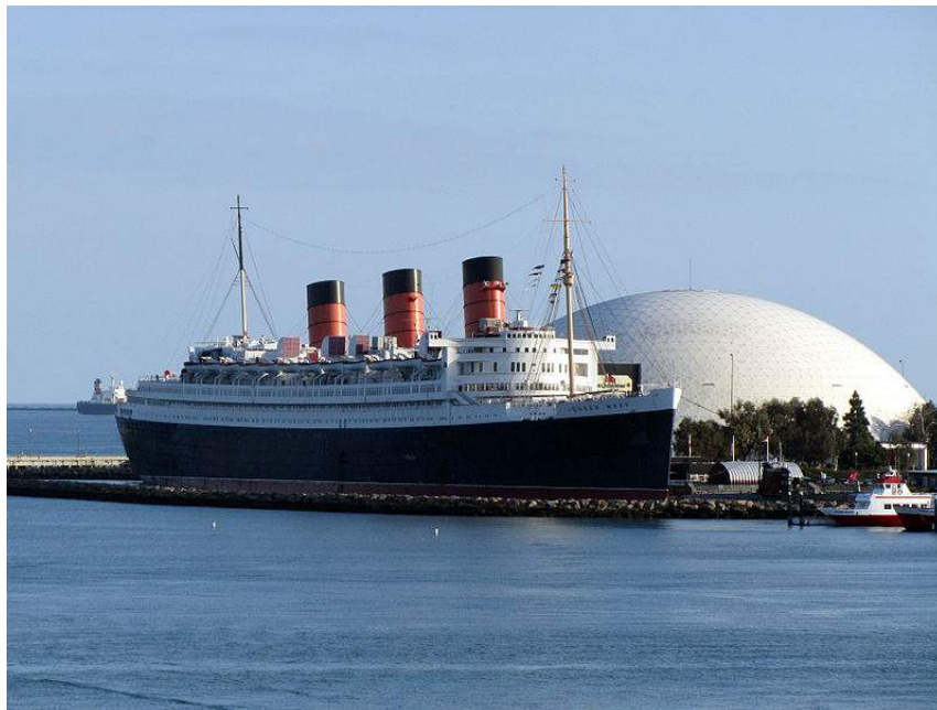
Fig. 4. RMS Queen Mary in Long Beach, CA

• Financial Woes for the RMS Queen Mary . The financial status of the RMS Queen Mary ocean liner (Fig. 4) has been rocky for quite a few years now, but the collapse of tourism from the coronavirus pandemic over the past year may have made its woes insurmountable. The City of Long Beach, CA, which is the ship's owner, has filed a court complaint against the real estate firm of Urban Commons for leaving the ship in a state of disrepair.