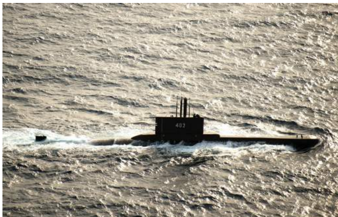
Fig. 3. KRI Nanggala 402 in 2015.

The German-built Indonesian submarine, KRI Nanggala 402 (Fig. 3) has apparently sunk with the loss of its crew of 53 while performing a training dive off the island of Bali on Wednesday, April 21. It was said to have enough oxygen on board until Saturday, April 24, should the crew have survived whatever caused the ship to sink.