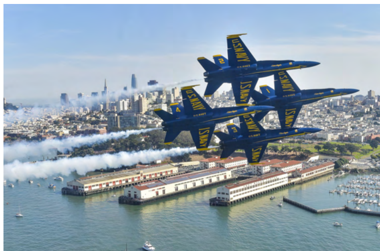
Figure 2. The Blue Angels flight demonstration team over San Francisco.

It looks like our traditional annual Fleet Week US Navy ship exhibition with the Blue Angels air show (Fig. 2) is scheduled to be on! We all certainly hope this will, indeed, come to pass.