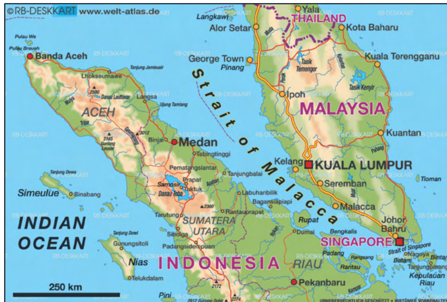
Fig. 5. The Strait of Malacca where there is much piracy of petroleum cargo ships going between the Middle East and Asia.

to be sold to clandestine buyers for below market prices. Almost sounds like what parasitic insects do!