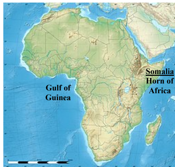
Fig. 4. Regions of Africa being afflicted by piracy on the high seas.

Piracy encounters in these regions typically involved kidnapping of cargo ship crews with pirate money being made from ransoms as well as selling any stolen cargo. Fortunately, security has improved off the Horn of Africa and the activities of Somali pirates have been mostly shut down from what I read. However, crew kidnappings still continue in the Gulf of Guinea where security remains light.