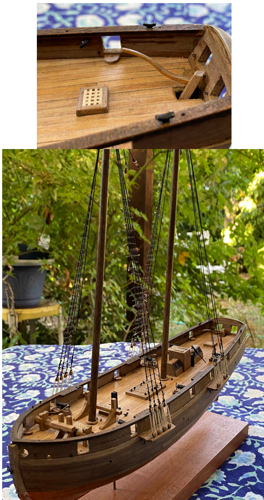
Fig. 7. More photos of HMS Pickle model