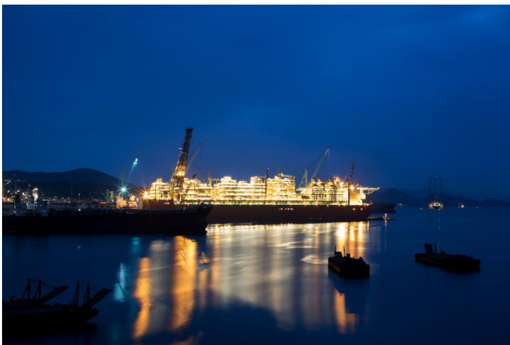
Fig. 3. Liquefied natural gas cargo ship, Prelude , under construction.

The cargo theory under which it was constructed was to fill up with LNG by directly going from one oceanic gas field to another without having to transfer gas from the drilling platform to onshore facilities first and then fill up the ship in port. This currently requires expensive pipelines that are a redundant step.