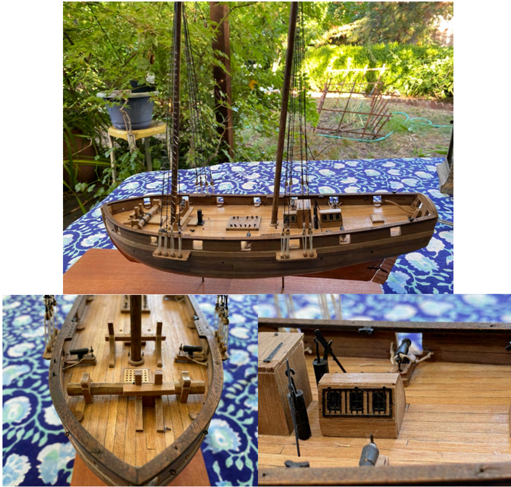
Fig. 6 Model of HMS Pickle by Jacob Cohn