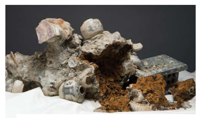
Fig. 5. Vietnamese artifacts recovered from a shipwreck.

Francisco early last year, but had to close prematurely due to the COVID pandemic. The museum has now scheduled a virtual online tour of these artifacts on Saturday, December 11 at 4 PM (Fig 5)