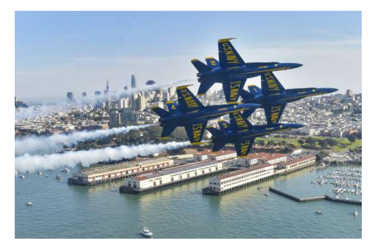
Figure 2. The Blue Angels flight demonstration team over San Francisco. Hair raising performance!