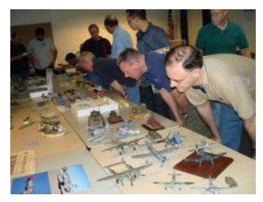
Fig. 4. Enjoying a display of models at a meeting of the Silicon Valley Scale Modelers.

They have changed their meeting location to: