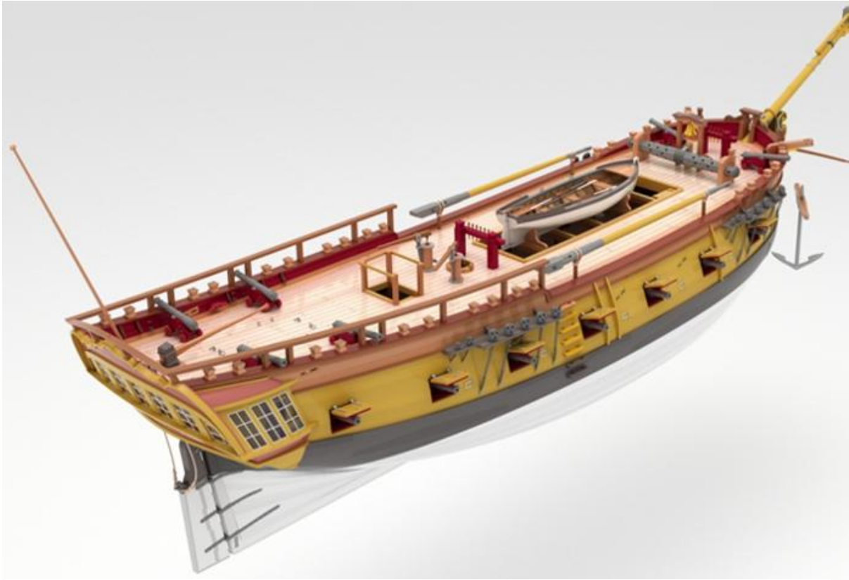
Fig. 13. British ship, HMS Ontario , 1779. Built for the British on Carleton Island in the St. Lawrence River and used to transport supplies and troops around what is now northern New York during the American Revolutionary War. She was sunk in Lake Ontario in a storm only 5 months after launching without ever seeing combat.

The wreck was discovered in 2008 and was found to be mostly intact. It is still the property of the U.K. and is considered a war grave. So, it has been left undisturbed. Admiralty drafts for this ship are in the possession of the National Maritime Museum, U.K. and can be seen in the ship's Wikipedia article.