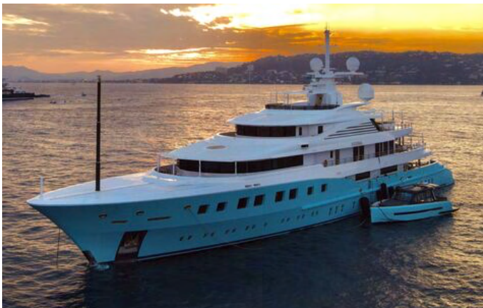
Fig. 8. Axioma

5. Axioma (Fig. 8): 72-meter motor yacht believed to be owned by the CEO of the steel group TMK. It is now detained in Gibraltar (U.K.) .