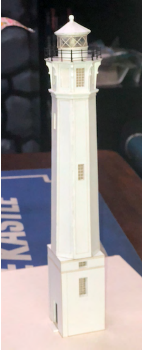
Fig. 19. Paper model of the Alcatraz lighthouse from Shipyard by George Sloup.