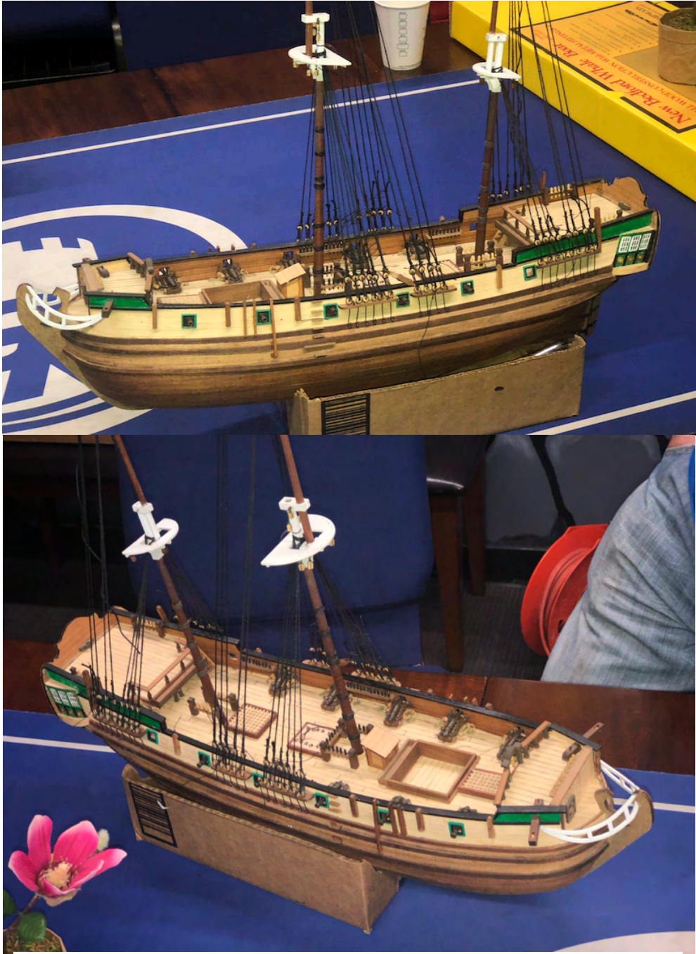
Fig. 20. Jim Rhetta's model of the bomb ketch, La Candelaria from Occe models.