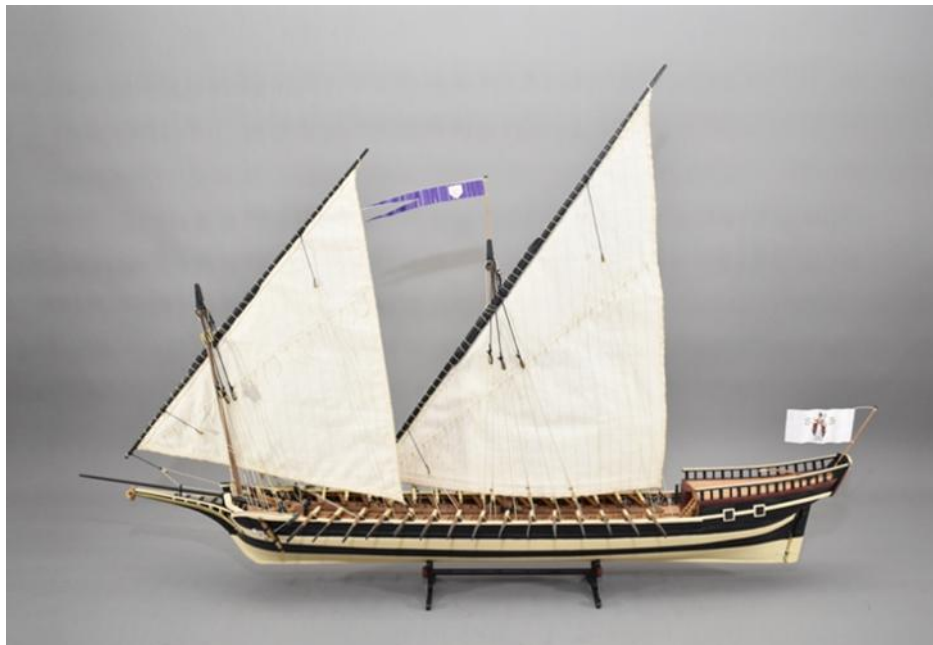
Fig. 12. Ragusian Galley of the 18 th Century.