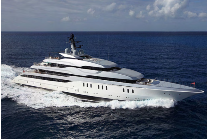
Fig. 5. Tango

2. Tango (Fig. 5): 77.7-metre motor yacht at the Marina Real in Palma de Mallorca, Spain . The vessel is said to be linked to Viktor Vekselberg , a sanctioned Russian billionaire. Spanish authorities say it is a focus of investigations into fraud and money laundering.