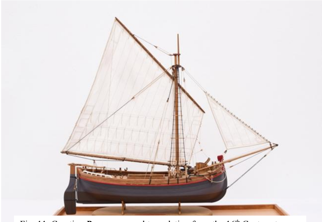
Fig. 11. Croatian Brazzara vessel type dating from the 16 th Century to modern times.