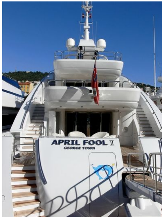
Fig. 1. For "Sail" on Craigslist! Become an Oligarch!