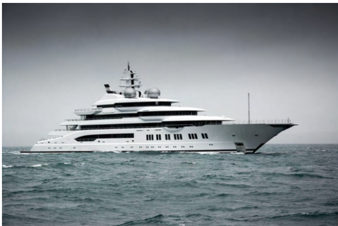
Fig. 4. Amadea

1. Amadea (Fig. 4): 106.1-meter superyacht docked in Fiji where it has been impounded over questions about its ownership.