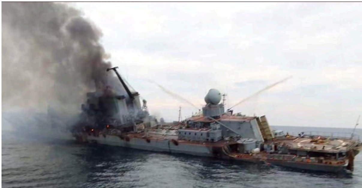
Fig. 3. The heavily damaged Moskva following shipboard explosions.

Moskva was laid down in 1976 in Mykolaiv , Ukraine and commissioned in 1983. It displaced 12,490 tons and was the flagship of the Russian Black Sea Fleet leading the naval portion of the invasion of Ukraine.