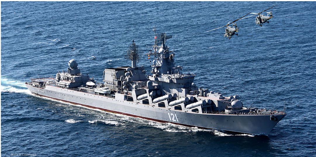
Fig. 2. Russian guided missile cruiser, Moskva . Check out the proximity of the two helicopters to each other in the upper right! Were they about to collide?!

Naturally, the Russians deny this was the case, but their Defense Ministry acknowledges that the ship was sunk as a result of an explosion in its ammunition magazine. A photo released to the press shows the ship to have sustained considerable damage (Fig. 3). At 12,490 tons displacement, it was the largest warship of the Russian Navy in the Black Sea as well as being the largest warship sunk in combat since WW 2. The extent of casualties has not been released, but it has been acknowledged that the commanding officer was killed. The ship carries a crew of around 500 men.