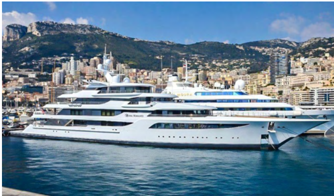
Fig. 9. Royal Romance

6. Royal Romance (Fig. 9): Another monster 92.5-meter motor yacht now impounded in Rijeka, Croatia is believed owned by Viktor Medvedchuk who holds the title of the People's Deputy of Ukraine . No doubt the title makes him the most equal of equals!