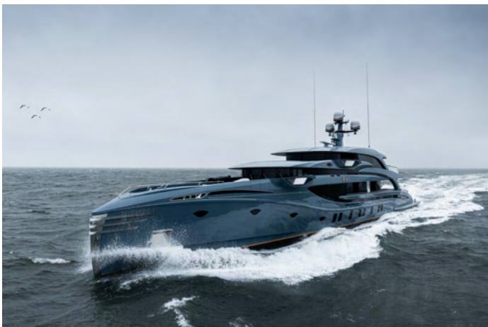
Fig. 6. Phi

3. Phi (Fig. 6): 58.5-metre superyacht detained in the U.K. over issues of ownership. Looks like a torpedo boat!