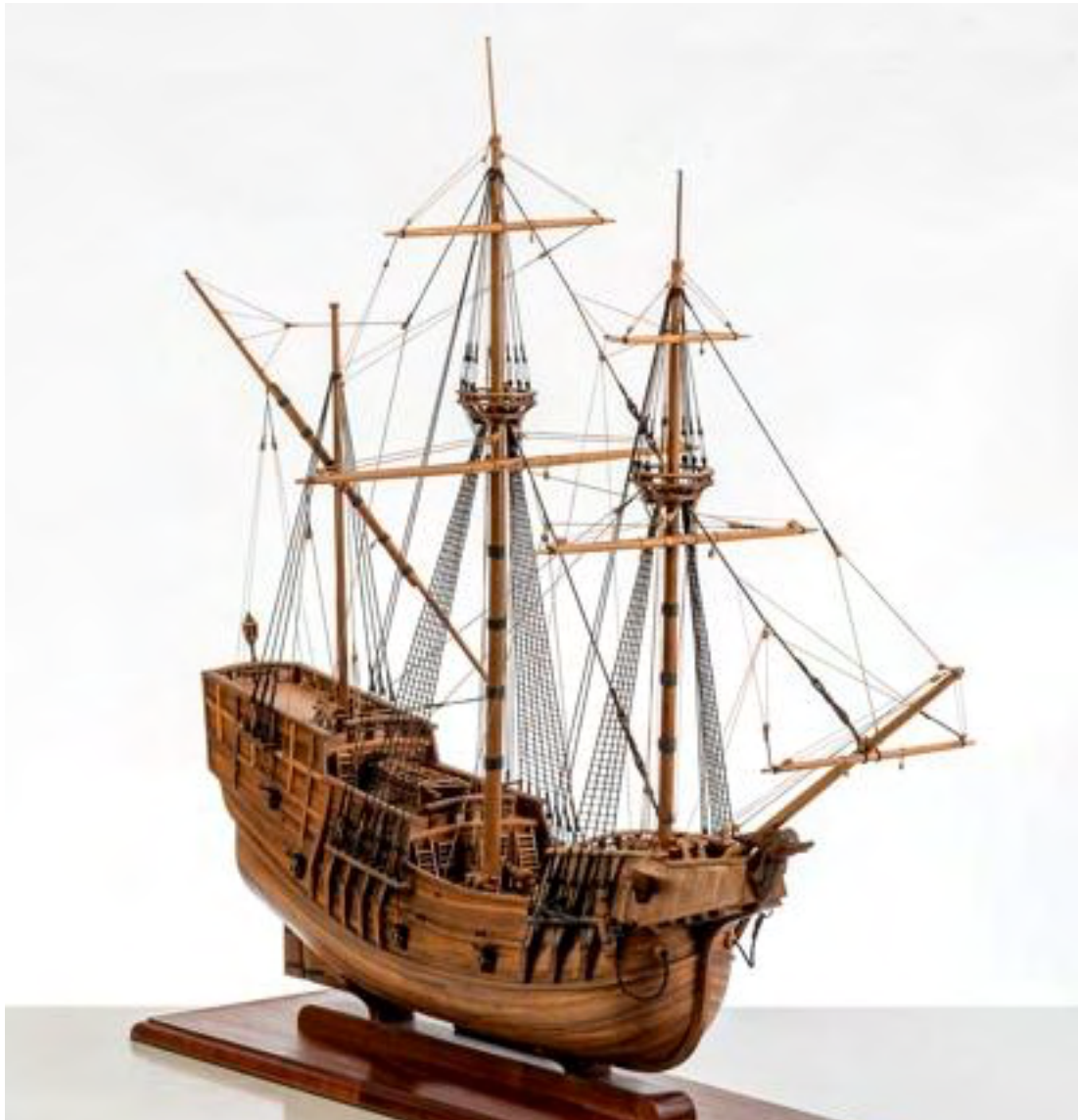
Fig. 10 Ragusian galleon, Argosy , of the 16 th and early 17 th Centuries. Ragusian refers to the Republic of Ragusa which was centered on the city of Dubrovnik.

Here are some samples of its offerings.