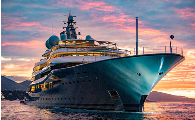
Fig. 7. Flying Fox

4. Flying Fox (Fig. 7): 136 meter monster yacht now detained in the Dominican Republic and under investigation by the US Dept. of Homeland Security. It is believed to be owned by the CEO of the Domodedovo airport in Moscow, Russia. This ship is said to be able to accommodate 22 guests looked after by a crew of 54. A rather opulent guest to crew ratio!