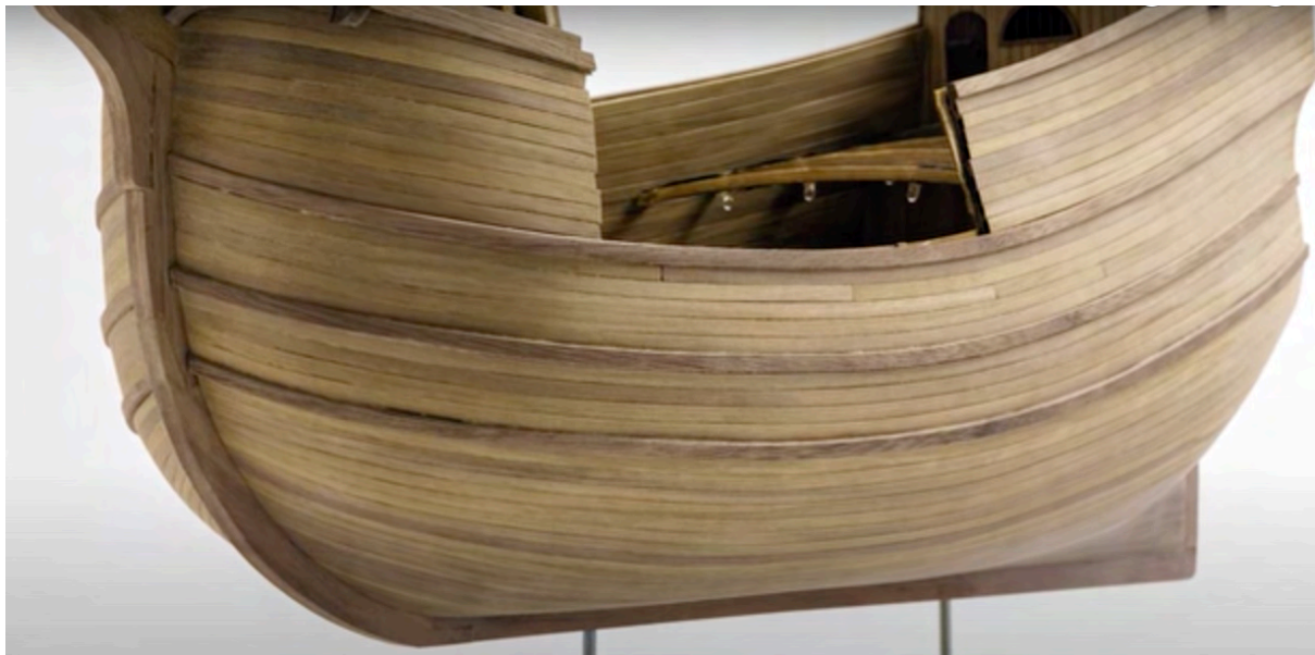
Fig. 14. Very nice hull planking of a 16 th Century Ragusian Carrack model from Maris Stella by Olha Batchvarov (Olha Batchvarov).

Last month, I listed some excellent planking videos by Chuck Passaro. This month, I found a really good planking video of a 16 th Cent. Ragusian Carrack (Fig. 14) from a kit by Maris Stella done by Olha Batchvarov.