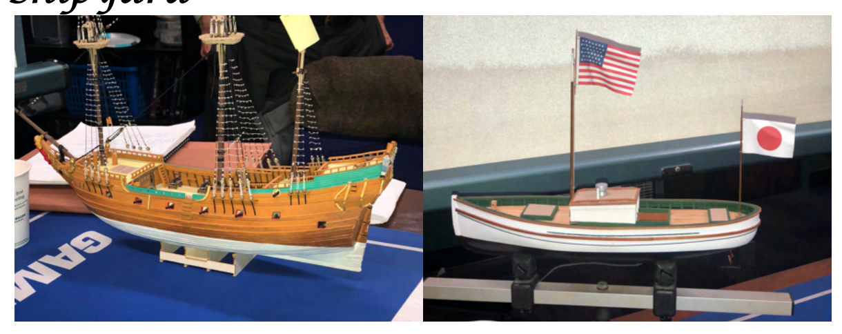
Fig. 7. Left- George Sloup has installed all the ratlines on his Papegojan . Right-Masts and flags installed on the fishing boat built for a diorama illustrating the Japanese immigrant community in Monterey, California by Clare Hess.

Under Construction at the Model Shipyard