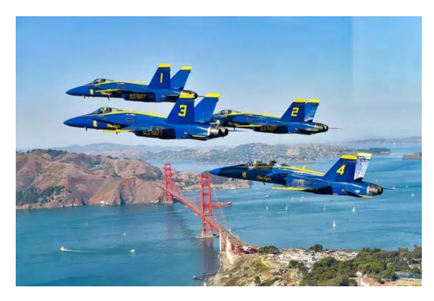
Fig. 2. The Navy's Blue Angels flying over the Golden Gate Bridge.

While the show can be observed for free anywhere on the north shore of San Francisco, ticketed reserved box seats can be purchased to provide a better view on the Marina Green.