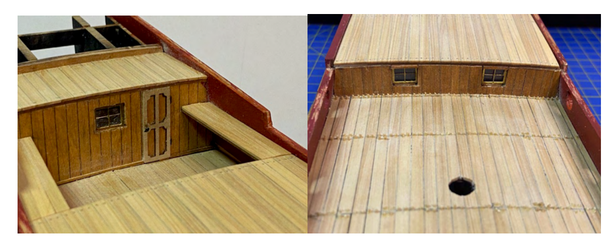
Fig. 12. Planking of raised Quarterdeck of the Charles Royal Yacht.