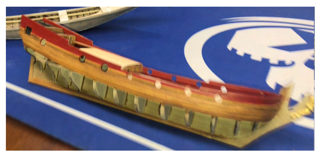
Fig. 9. Frame and planking by Clare Hess of the Charles Royal Yacht model from Woody Joe .