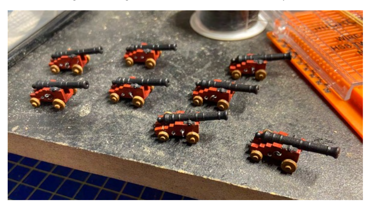
Fig. 13. Ceremonial cannon for the Charles Royal Yacht model.