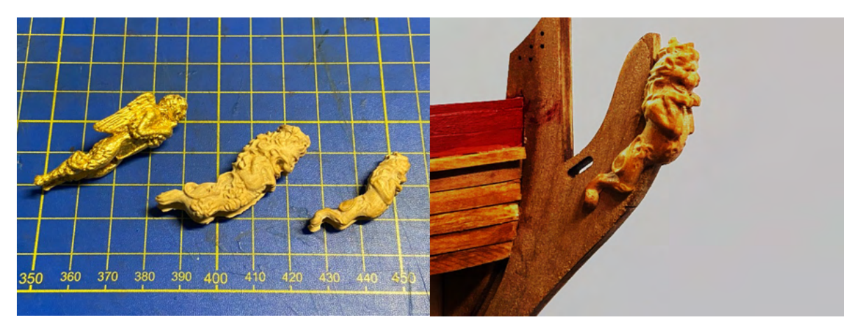
Fig. 10. Clare Hess had Cafmodel (See May, 2023 Foghorn) do a custom CNC carved boxwood Lion figurehead for the Charles Royal Yacht . The Left picture shows, from left to right, the original angel figurehead, a larger scale Lion figurehead, and a smaller scale Lion figurehead. On the Right, the smaller scale Lion figurehead installed. It looks more to scale with what is found on the original Admiralty model of 1690. These carvings look really good!