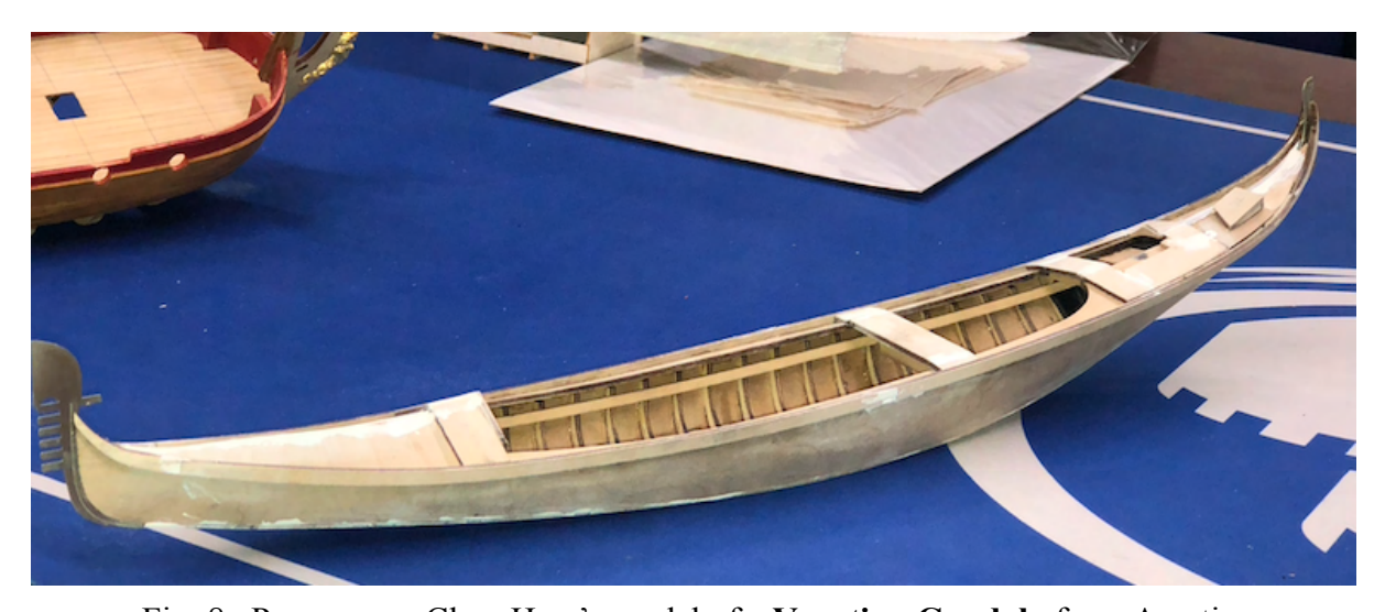
Fig. 8. Progress on Clare Hess's model of a Venetian Gondola from Amati.