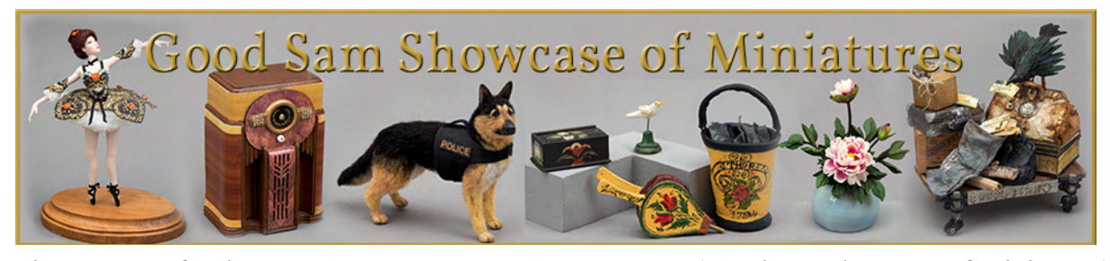
Fig. 3. Poster for the Good San Showcase of Miniatures. (Good San Showcase of Miniatures)

This annual convention of mostly dollhouse miniatures in San Jose is scheduled this year for the weekend of October 14 and 15 (Fig. 3). Last year, we had a very successful display of almost a dozen ship models from the SBMS. The event will be held at: