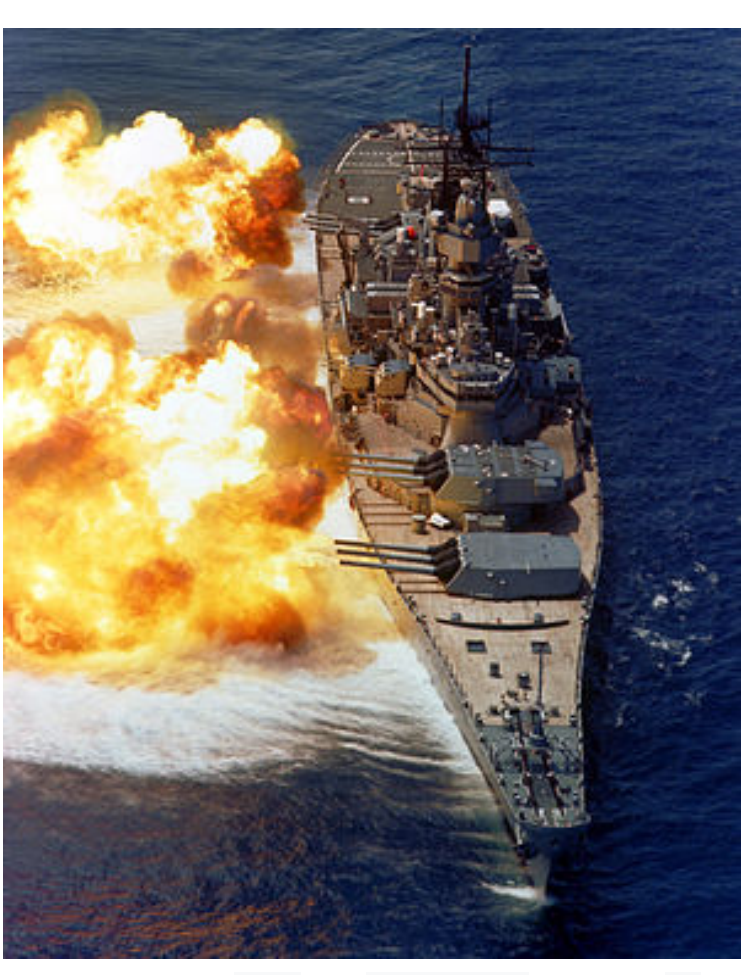
Fig. 5. BANG!! USS Iowa unleashes a broadsides of nine 16-inch guns on 15 August 1984 during a firepower demonstration

But in the heat of battle, what were the most distant actual hits ever attained? While surfing YouTube, I found a fascinating video illustrating the answers to this question. It can be watched at: