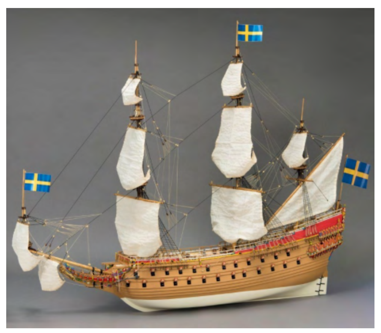
Fig. 8. Wasa model from Artesania Latina (Artesania Latina)

The famous Swedish warship which sank in Stockholm harbor on her maiden voyage in 1628. Retrieved in 1961 and restored as a museum ship in Stockholm. The Wasa looks especially nice. The late Charlie Parsons built one without rigging and is now on display in the San Mateo County History Museum in downtown Redwood City.