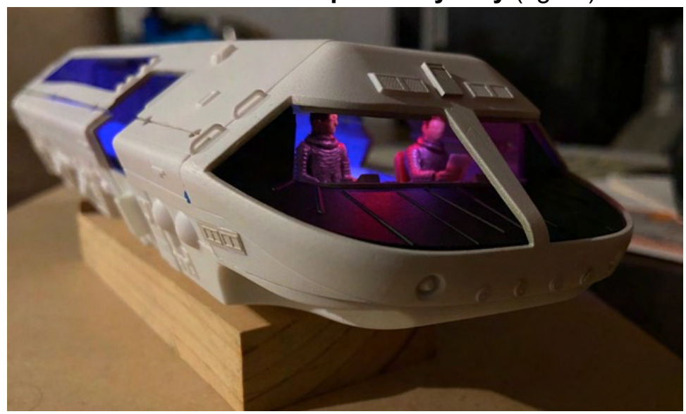
Fig. 6. LED lights illuminating the interior of a Moon Bus model from the movie, 2001: A Space Odyssey. The LED bulbs are not attached to any wires inside the model. Instead, the bulbs are powered wirelessly from an electrical induction coil installed in the base. There is no need to install wiring inside the model itself. (Clare Hess)

This "wireless" form of charging has now been applied to miniature LED lights for various applications. Clare Hess has introduced us to wireless LED lights for illuminating models with his first application to a model of the Moon Bus model from the movie 2001: A Space Odyssey (fig. 6.).