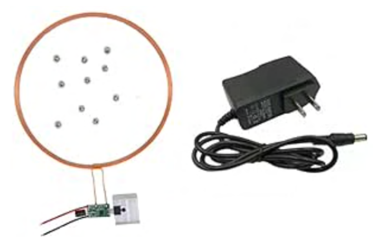
Fig. 7. A wireless LED induction charger kit with miniature LED bulbs

The advantage of this kind of lighting is that there is no longer a need to feed electrical wire into the model itself. The light bulbs merely need to be installed in any desired location in the model. The induction coil responsible for powering a current in the bulbs is installed in the base of the model display in proximity to the model and still needs to be plugged into a power source (Fig. 7). Search "Wireless LED" for these online to see where they can be purchased.