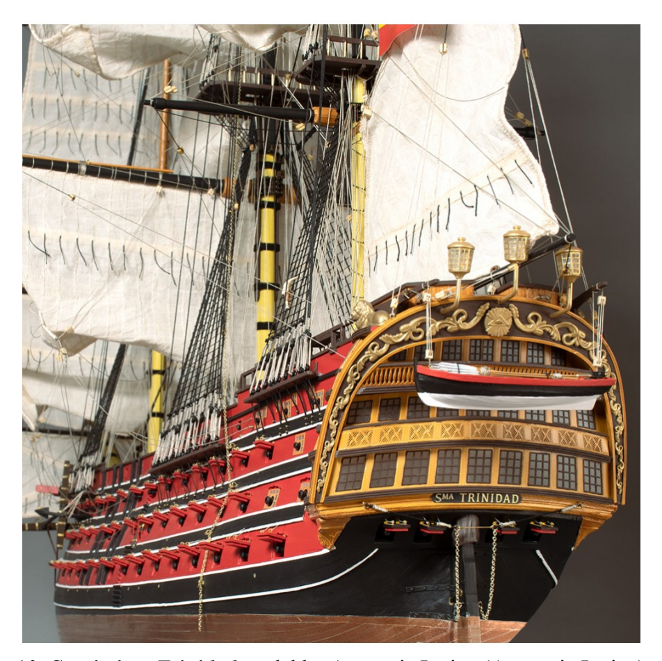
Fig. 10. Santissima Trinidad model by Artesania Latina (Artesania Latina)

Lead ship of the Spanish fleet at Trafalgar in 1805 joining with the French against the English. She was heavily damaged in the battle and eventually captured by the English. However, due to the heavy damage she was scuttled by her captors.