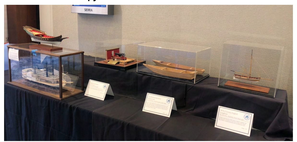
Fig. 2. The SBMS exhibition table at Good Sam's Showcase of Miniatures. We need more models so time to get to work!

Participation from the SBMS club at Good Sam's Showcase of Miniatures in San Jose was a bit spare this year with only five models contributed to our exhibition. Nonetheless, they were all masterpieces so there was still much to admire. Fig.2. shows our table. I hope there will be more models next year. We have a whole year to complete more! Close up pictures below in the Model Shipyard section.