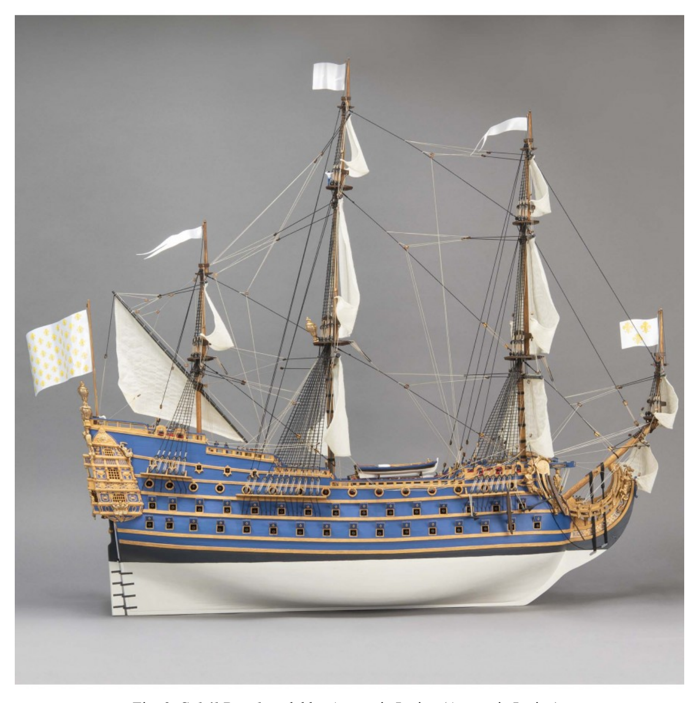
Fig. 9. Soleil Royal model by Artesania Latina (Artesania Latina)

Built for Louis XIV in 1670. Participated in the Battle of Beachy Head against the English in 1690 near the Isle of Wight. Also participated in the Battle of Barfleur and the Battle of Cherbourg both in 1692 all part of the Nine Year's War.