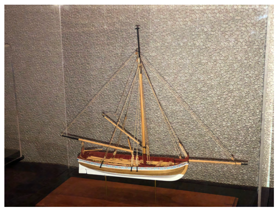
Fig.11. Clare Hess's model of the Medway Longboat built from a kit by Model Shipways developed by Chuck Passaro. Very cute!

These are the SBMS models which were brought to the Good Sam's Showcase of Miniatures convention in San Jose. Though not many models this year, but the workmanship is first rate!