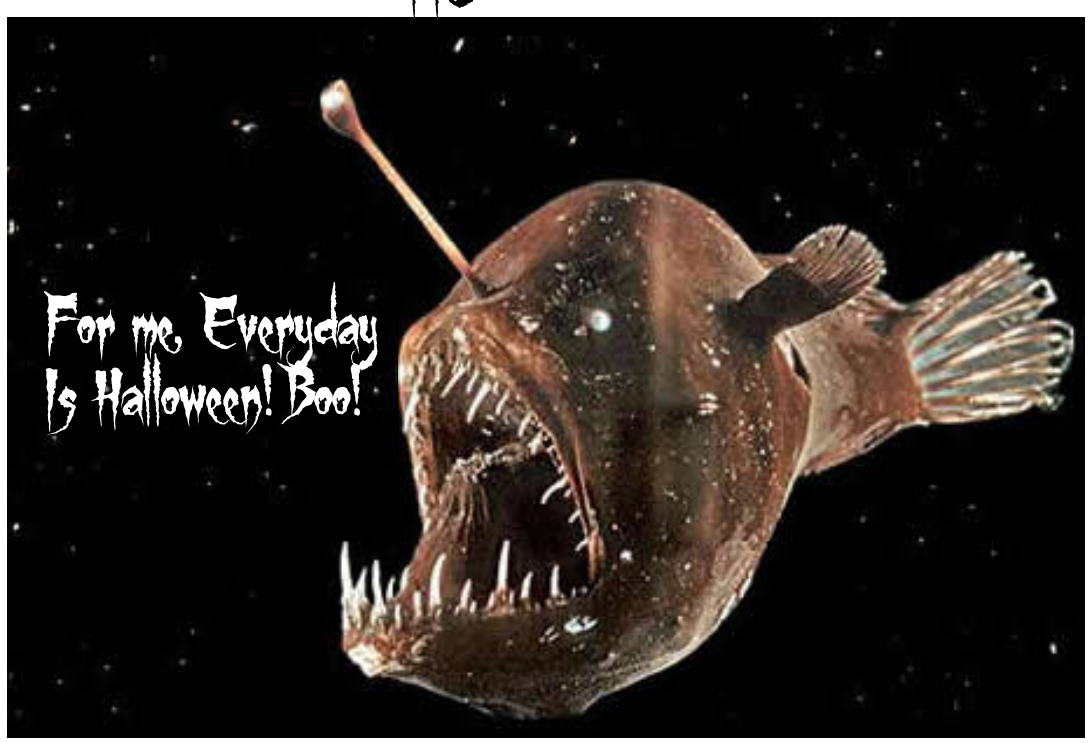
Fig. 1. Shiver me Timbers from the Dead Sea!