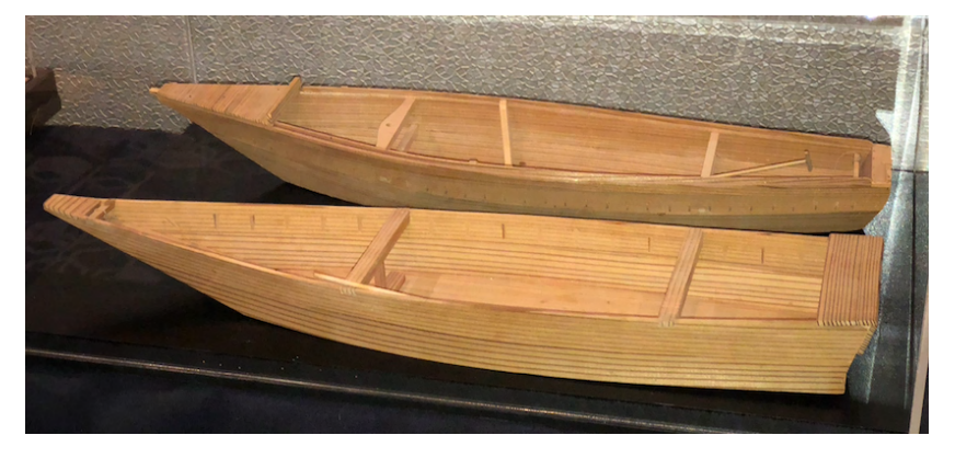
Fig. 12. Models of traditional Japanese boats by Clare Hess. One is a fishing boat from the Hozu river near Kyoto. The other is a seaweed harvesting boat of a type used in Tokyo Bay until the 1960s. The models were built from Japanese Cedar or Sugi.