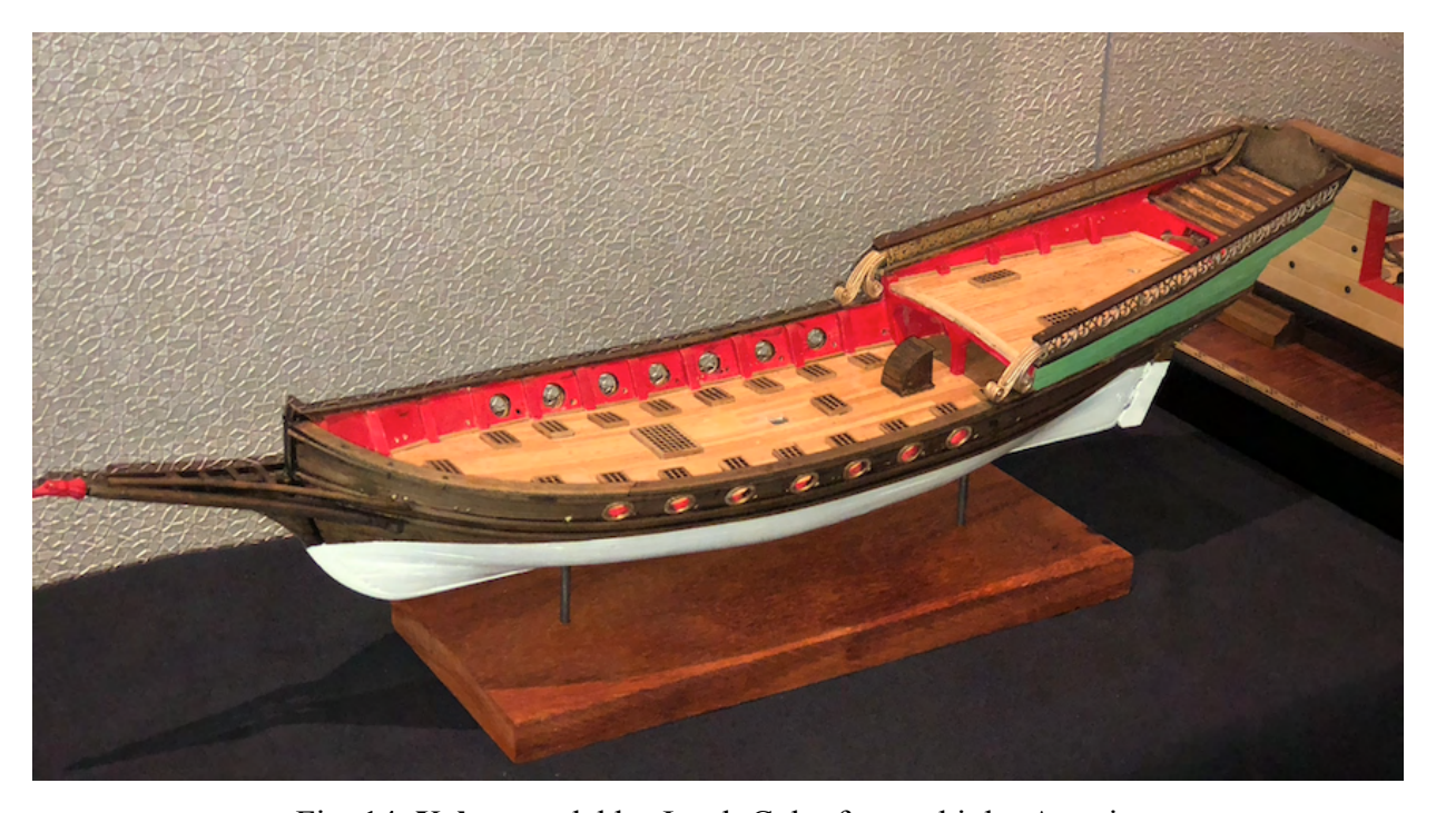
Fig. 14. Xebec model by Jacob Cohn from a kit by Amati.