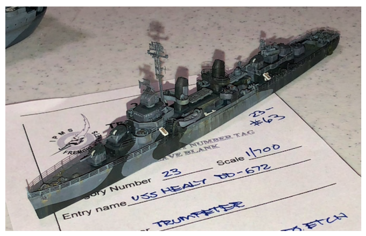
Fig. 18. Fletcher class US destroyer, USS Healy (DD-672) , from 1/700 Trumpeter kit by unknown modeler displayed at the IPMS Tri-City Classic.