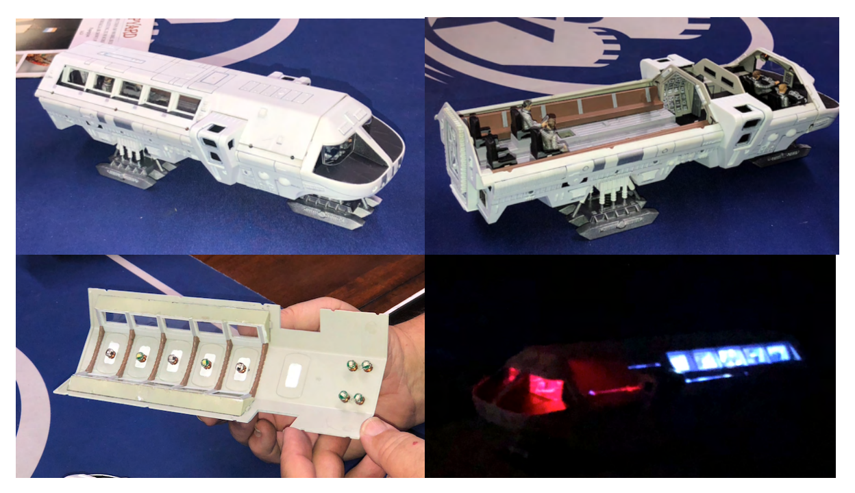
Fig. 11. Model of the Moon Bus from the movie, 2001: A Space Odyssey being built by Clare Hess. Illustrated are the wireless LED lighting array discussed in the October, Foghorn.