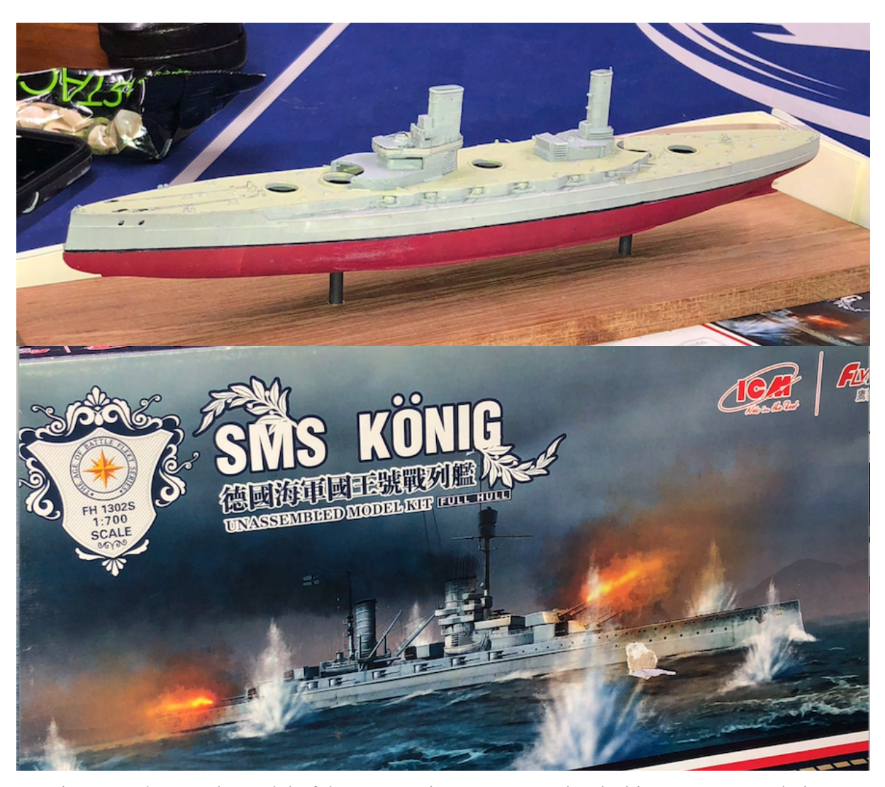
Fig. 9. A 1/700 scale model of the WW 1 vintage German battleship, SMS König , being built by Jacob Cohn. She was the lead ship in the German line of battleships at Jutland in 1916. König was scuttled at Scapa Flow following the surrender of the German High Seas Fleet to the British in 1919.