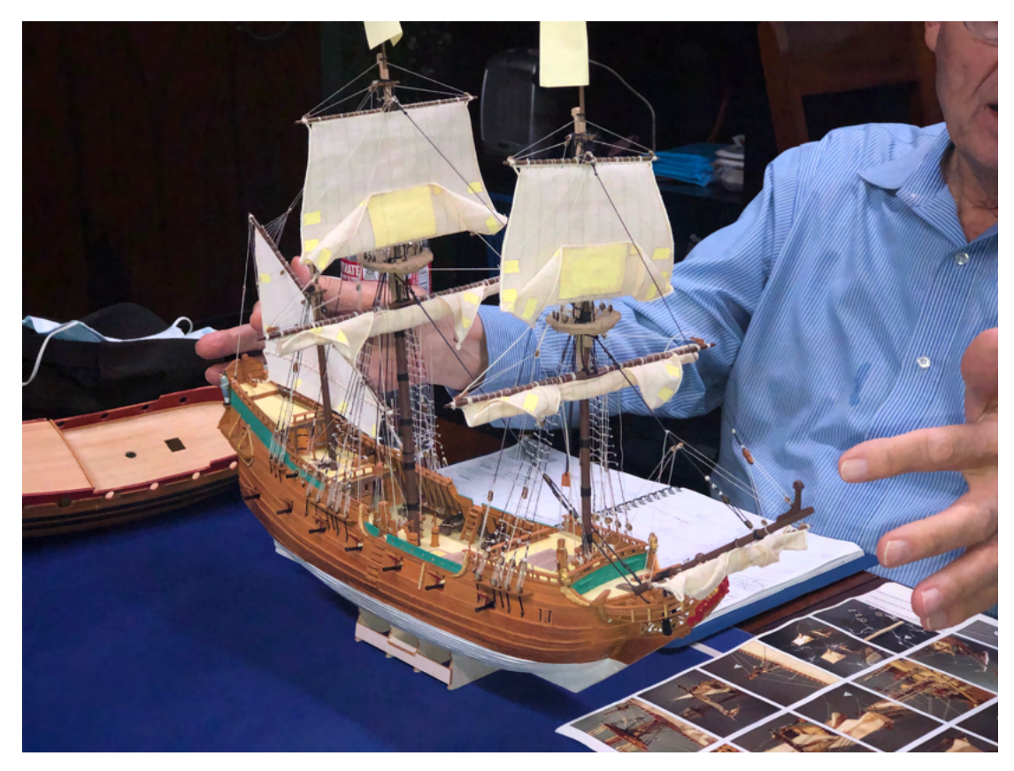
Fig. 10. Progress on the rigging and sails of George Sloup's Papegojan . This model was displayed at the IPMS Tri-City Classic, November 25.