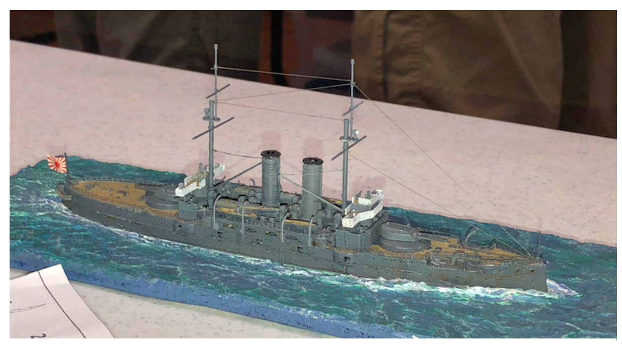
Fig. 19. 1/700 Hasagawa kit of Japanese battleship Mikasa which served as flagship during Battle of Tsushima in 1905 against the Russians. Model by unknown modeler on display at the IPMS Tri-City Classic.