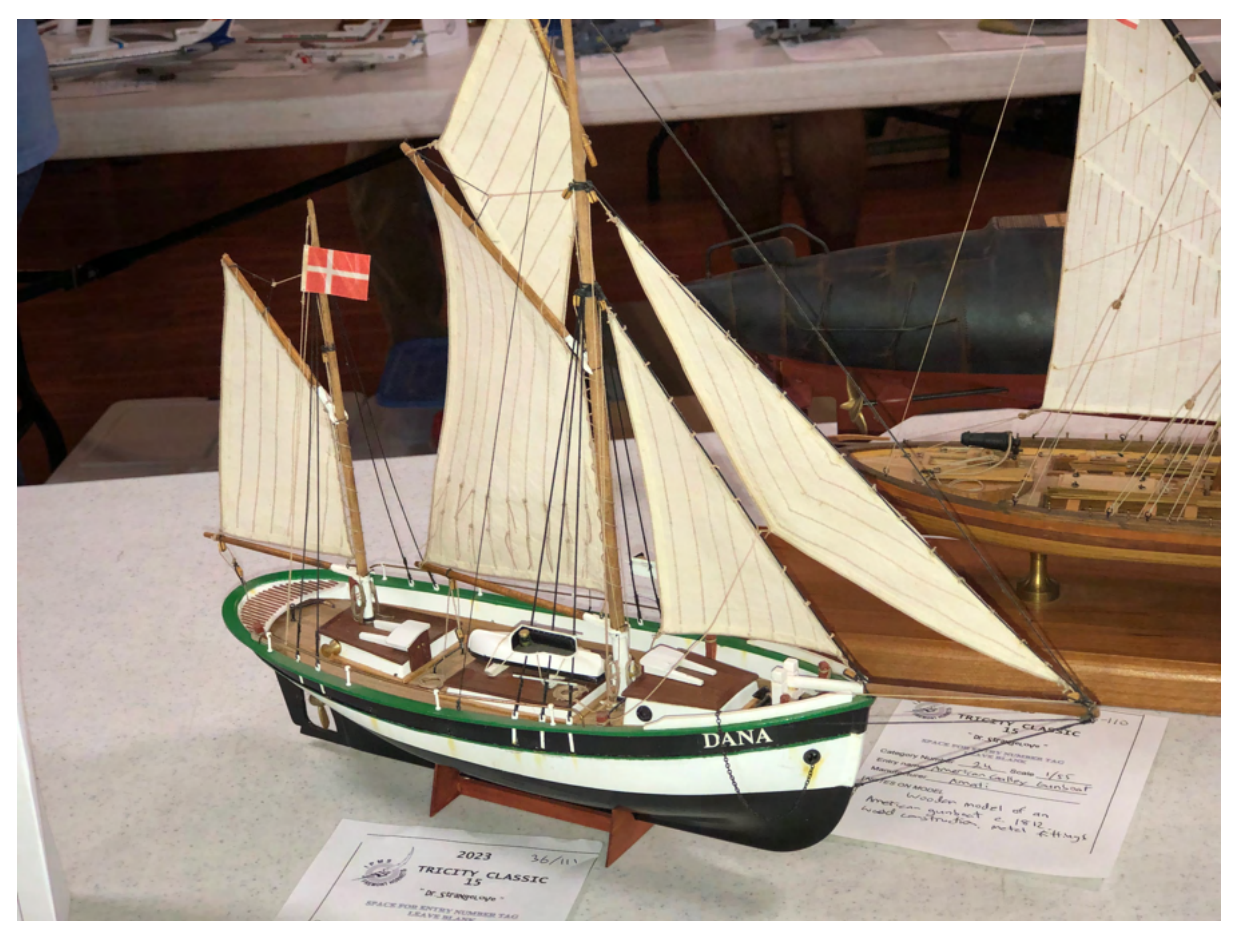
Fig. 14. Danish fishing cutter, Dana , built by Clare Hess from a Billings Boats kit. Displayed at the IPMS Tri-City Classic.