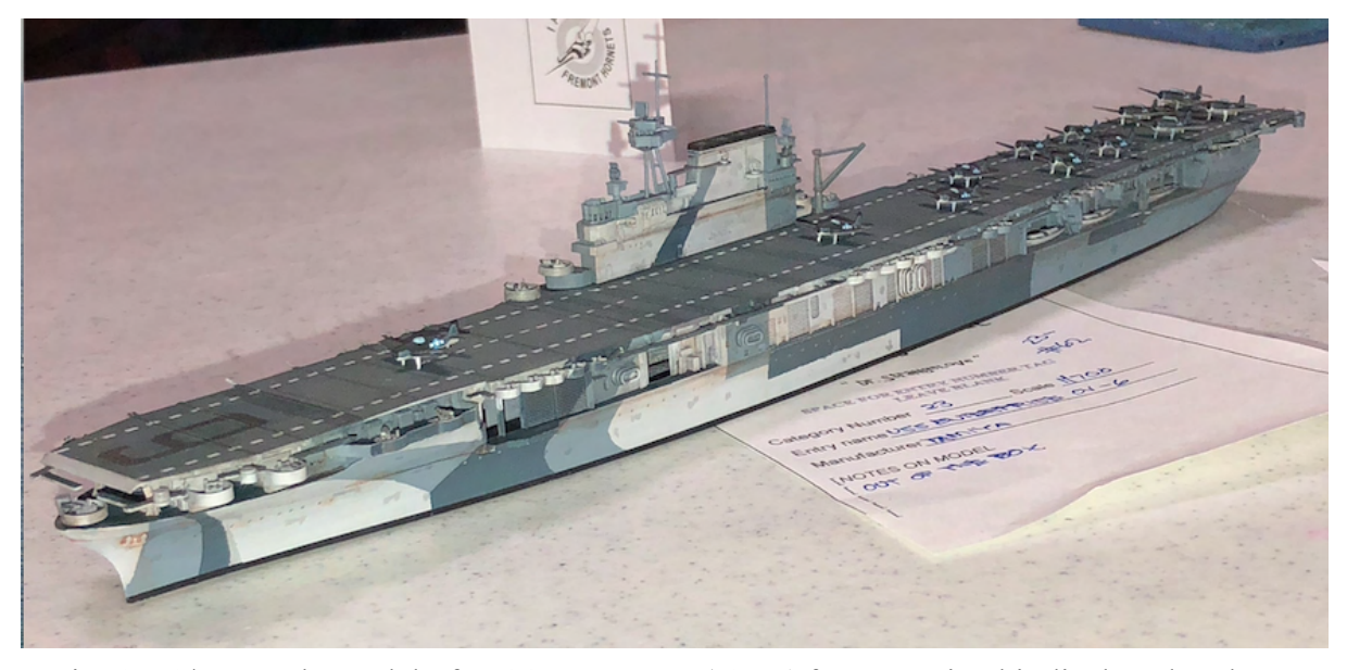
Fig. 17. 1/700 scale model of USS Enterprise (CV-6) from Tamiya kit displayed at the IPMS Tri-City Classic by unknown modeler.