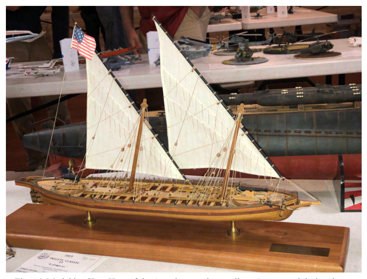
Fig. 16. Model by Clare Hess of the American gunboat galley, Arrow , used during the Battle of Lake Champlain in 1814. Model displayed at the IPMS Tri-City Classic.