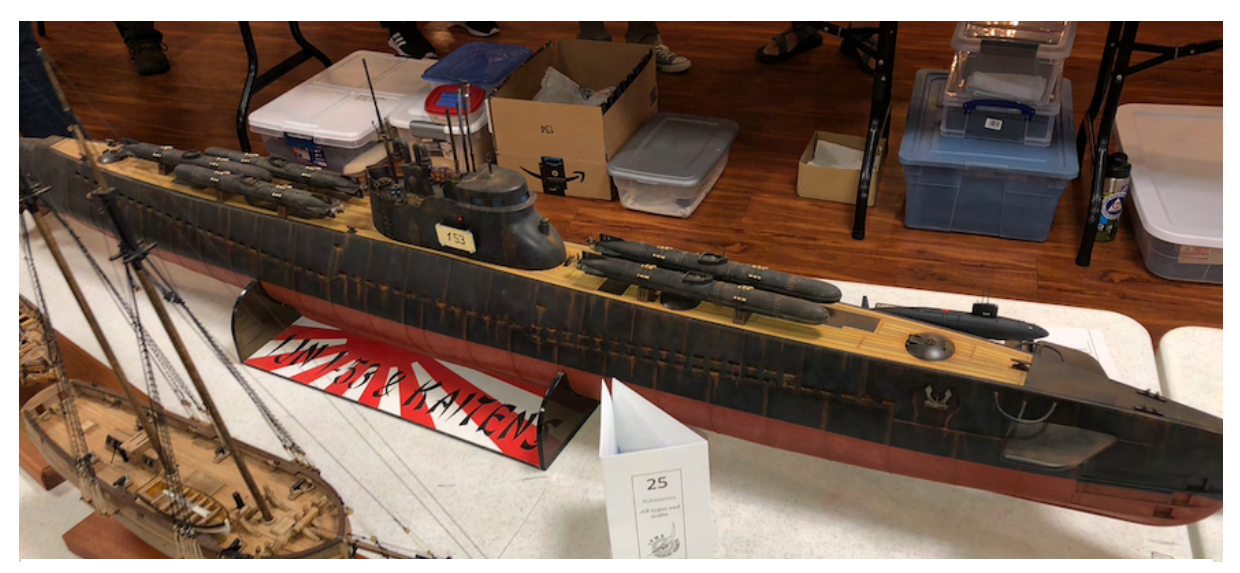
Fig. 20. Large 1/72 model from Lindberg of the WW 2 Imperial Japanese submarine, IJN I-53 with Kaiten manned suicide torpedoes on deck. Built by an unknown modeler and displayed at the Tri-City Classic. A review of this kit can be found in Fine Scale Modeler magazine at:

https://finescale.com/product-info/kit-reviews/2009/10/lindberg-1-72-scale-ijn-i-53submarine-and-kaitens