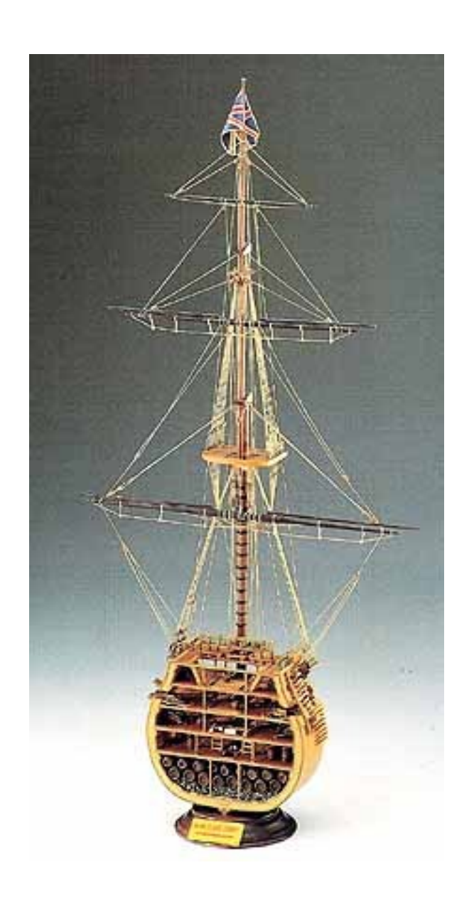
Fig. 5. Corel kit of HMS Victory cross section model in 1/98 (Ages of Sail).