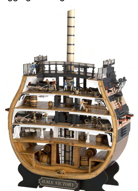
Fig. 8. The 1/72 Artesania Latina HMS Victory cross-section model

Now, Artesania Latina , is issuing a kit of this subject in 1/72 (Fig. 8) which is the same scale as Caldercraft's large complete Victory ship model. This model does not have a complete mainmast with yards and rigging although the modeler can scratch build these additions if so wished.