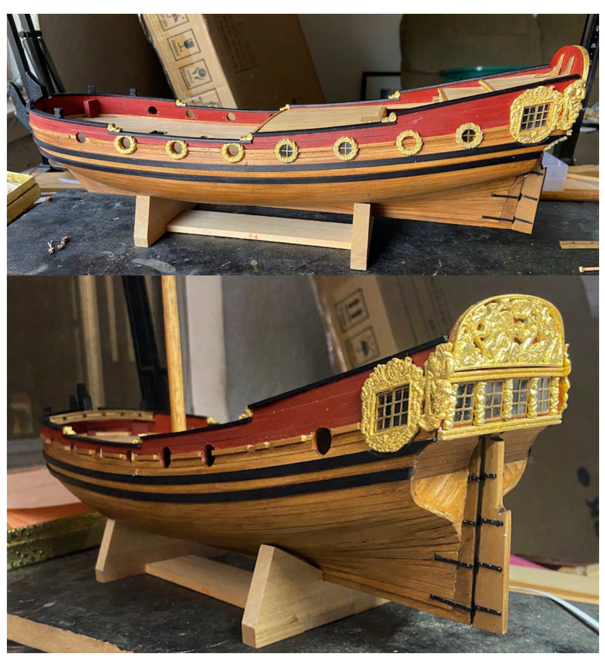
Fig. 13. Gold leaf covered decorations on the Charles Royal Yacht model from Woody Joe being built by Clare Hess.