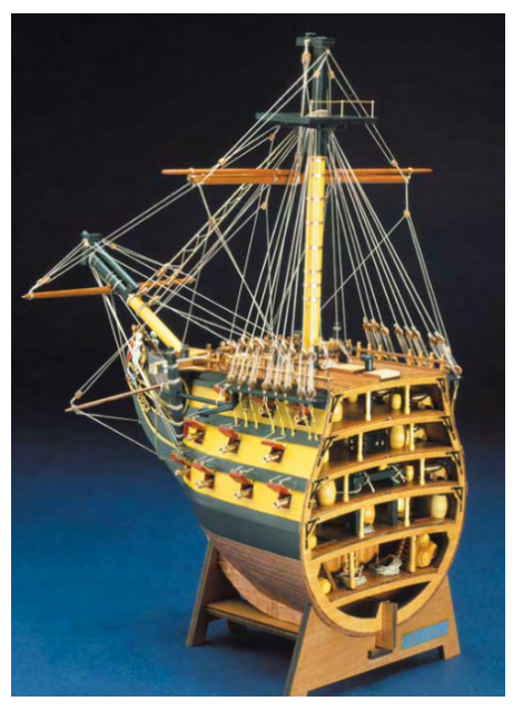
Fig. 7. Mantua model of HMS Victory bow section. (Mantua)

For those looking for a bit more than a cross-section, Mantua offers an HMS Victory bow section that is pretty impressive at 1/78 scale (Fig. 7).