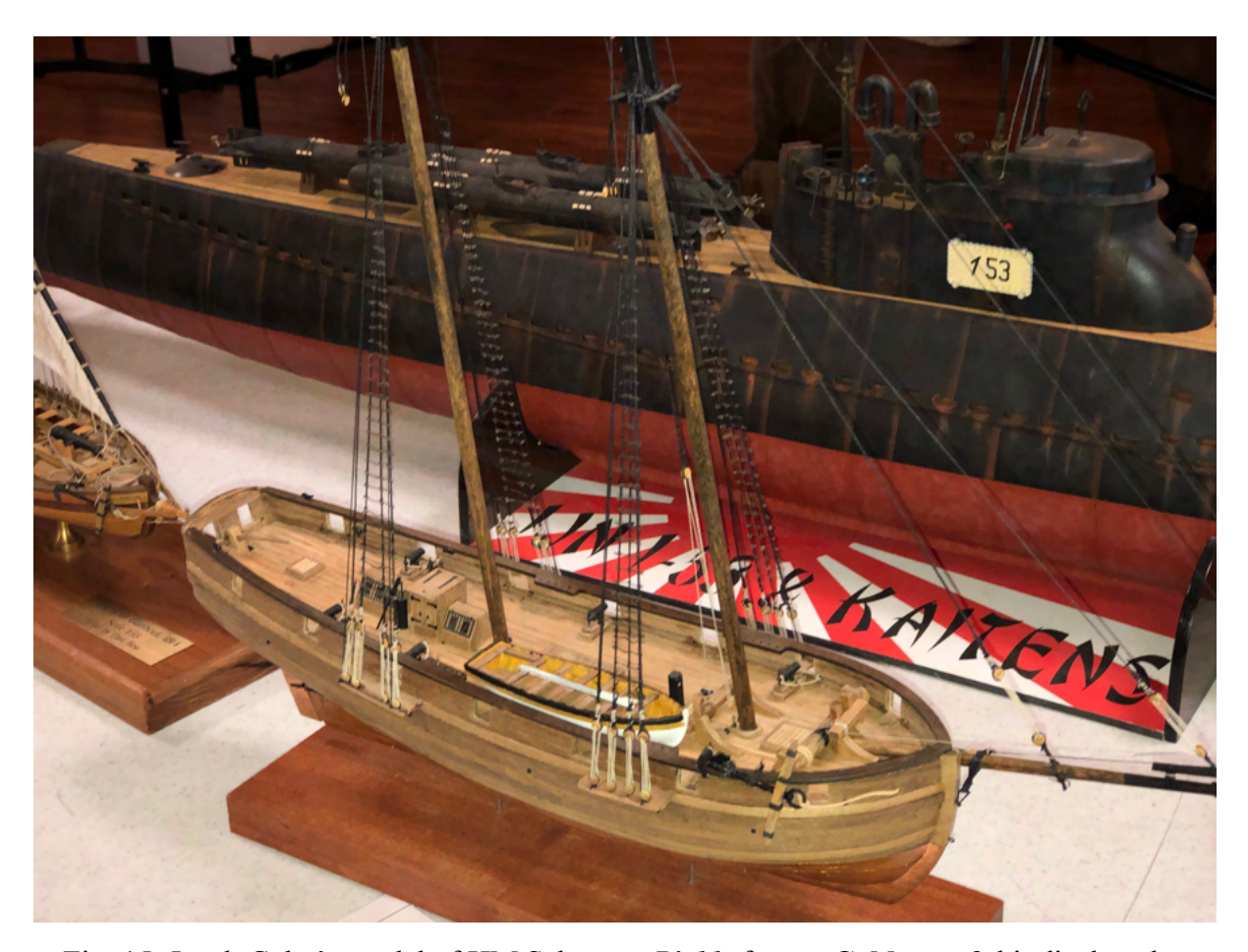
Fig. 15. Jacob Cohn's model of HM Schooner Pickle from a Caldercraft kit displayed at the IPMS Tri-City Classic. The Pickle was the first ship to bring home news of the Royal Navy's victory at Trafalgar in 1805.