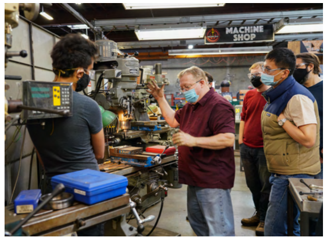
Fig. 3. Instructor leading students in a machine shop class. (The Crucible)