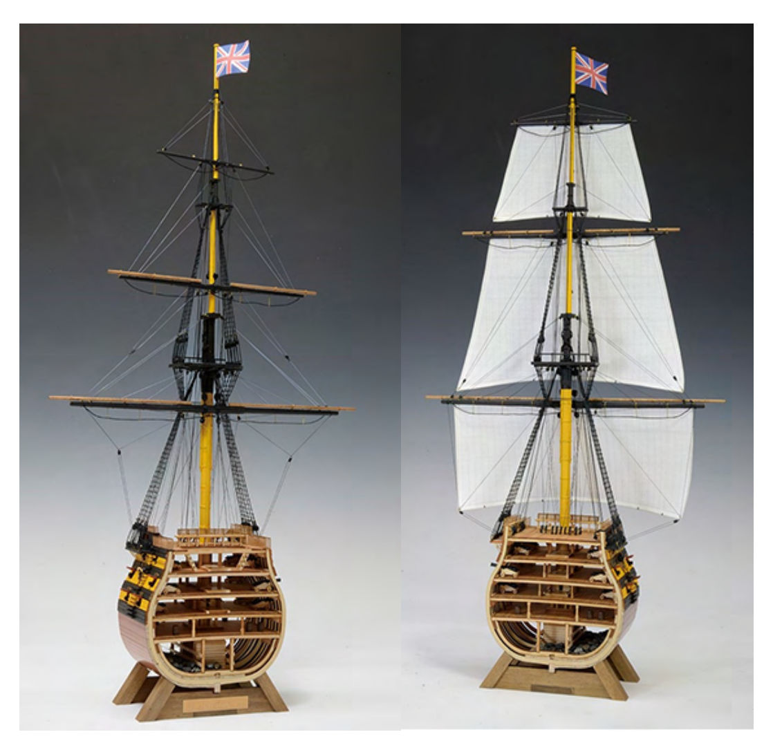
Fig. 6. Cross-section models of HMS Victory without and with sails in 1/160 scale from Woody Joe (Woody Joe).

Then, the Japanese firm, Woody Joe , Introduced a much smaller one at 1/160 scale. (Fig. 6) which can be purchased and built with or without sails.