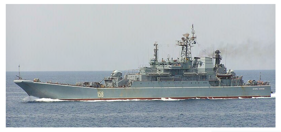
Fig. 6. Russian landing ship, Caesar Kunikov as seen in 2003. (Luis Díaz-Bedia Astor) The bow has two doors in the front that can open to disgorge cargo.

More recently, on February 14, 2024, near the second anniversary of the sinking of the Moskva , the Russian landing ship, Caesar Kunikov (Fig. 6), was attacked and heavily damaged by sea-drones punching holes into the port side of the ship leading to its sinking. Remote video taken of the attack from a drone has been released to the press showing explosions on the Kunikov (Fig. 7, 8, 9).