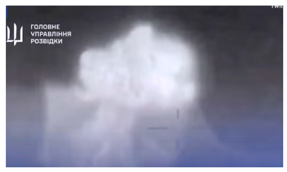
Fig. 7. Mushroom cloud from sea-drone impacting Caesar Kunikov .