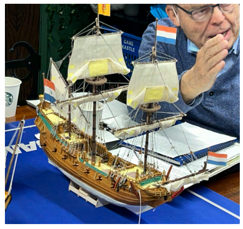
Fig. 12. Almost finished! The Papegojan from Shipyard models built by George Sloup (on the right).