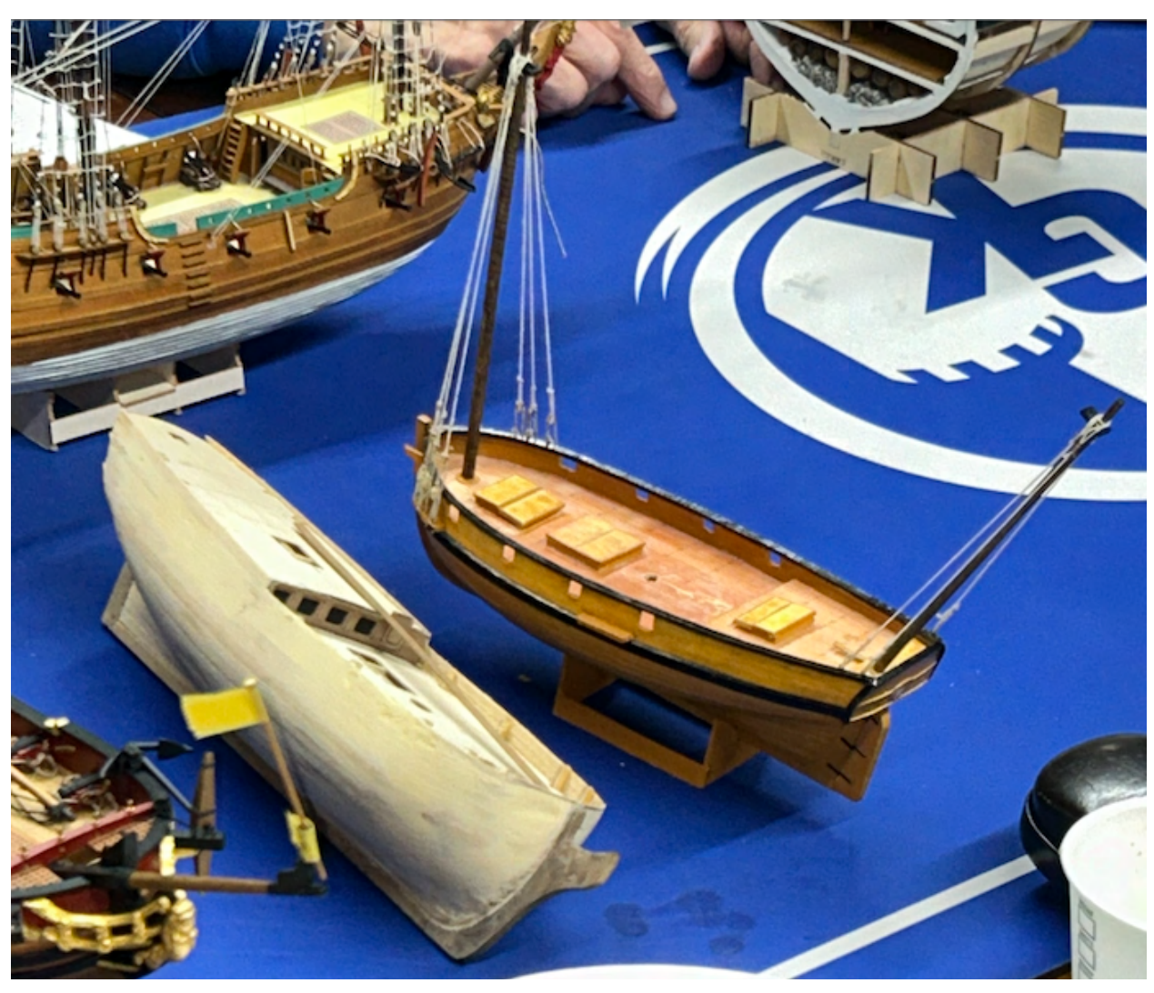
Fig. 11. Two boats in progress by Jacob Cohn. The unpainted hull on the left is that of Vanguard models's HMS Speedy. The model on the right is a card model from Shipyard of Le Coureur .