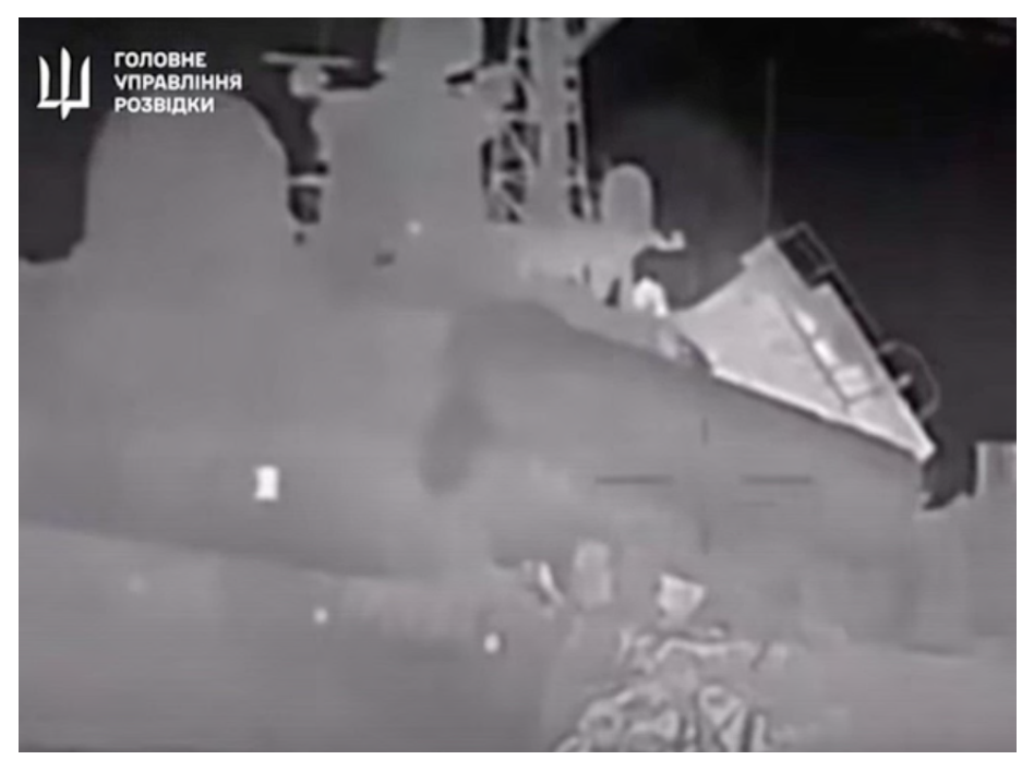
Fig. 8. Fiery hole blown into port side of Caesar Kunikov below the superstructure. (Ukrainian Defense Forces)