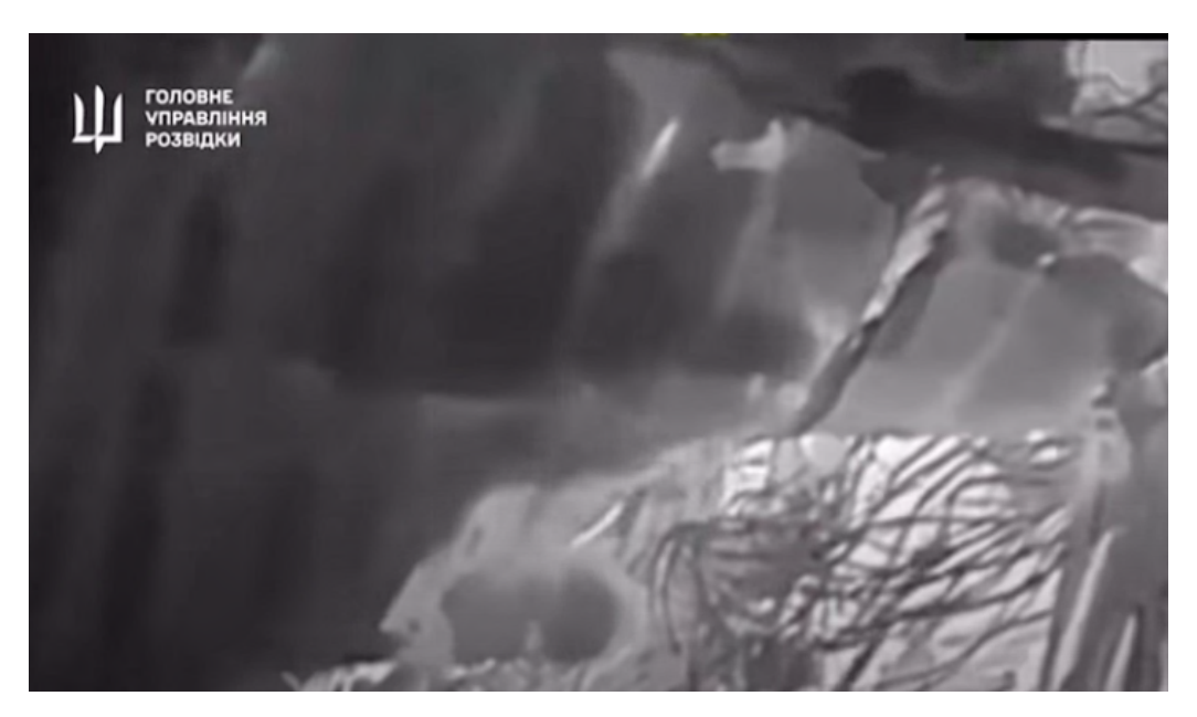
Fig. 9. View into the burning hole punched into side of Caesar Kunikov .

To date, the Ukraine military, through the press, has claimed disabling up to 25 Russian ships and one submarine amounting to one third of the Black Sea Fleet. Most of these operations used what they call the "MAGURA" V5 drones (Fig. 10) packed with 500 pounds of explosives and powered by jet ski engines. More on Ukrainian sea-drones in the December 2022 Foghorn.