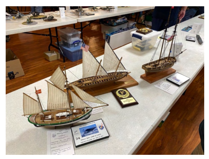
Fig. 5. Models entered by SBMS members in the recent 2023 IPMS Tri-City Classic model convention in Fremont. Left to Right: Fishing cutter, Dana , American Gunboat, Arrow , HM Schooner, Pickle . Close up photos of these models in the November Foghorn . (Jacob Cohn)