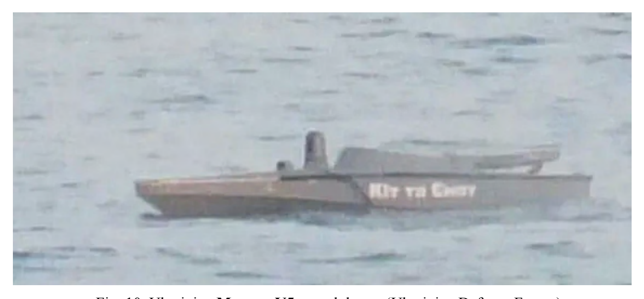
Fig. 10. Ukrainian Magura V5 armed drone

To date, the Ukraine military, through the press, has claimed disabling up to 25 Russian ships and one submarine amounting to one third of the Black Sea Fleet. Most of these operations used what they call the "MAGURA" V5 drones (Fig. 10) packed with 500 pounds of explosives and powered by jet ski engines. More on Ukrainian sea-drones in the December 2022 Foghorn.