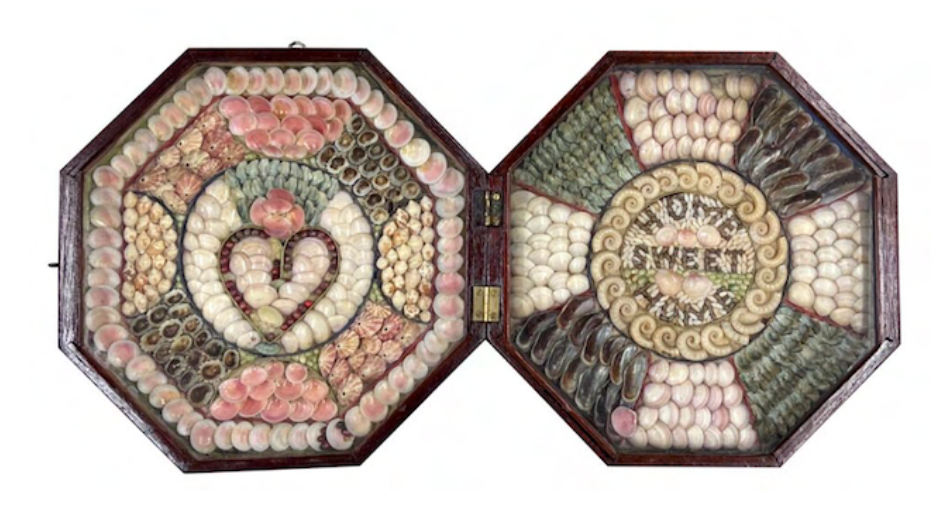
Fig.1. 19<sup>th</sup> Century folk art item often referred to as a "Sailor's Valentine" from the collection of the South Street Seaport Museum, New York City.