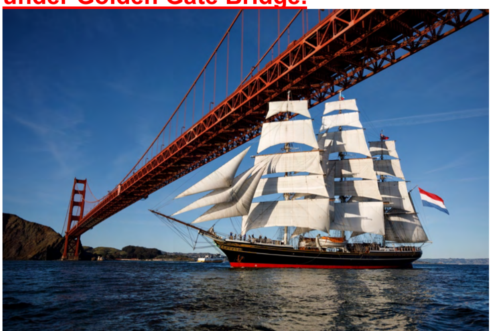
Fig. 2. Dutch tall ship, Stad Amsterdam passing under Golden Gate Bridge. This ship is scheduled to arrive under the Golden Gate Bridge Wednesday, March 6 sometime in the afternoon. (Stad Amsterdam)

• Wednesday, March 6, 2024 Sometime in Afternoon. Arrival of Tall Ship, Stad Amsterdam under Golden Gate Bridge.