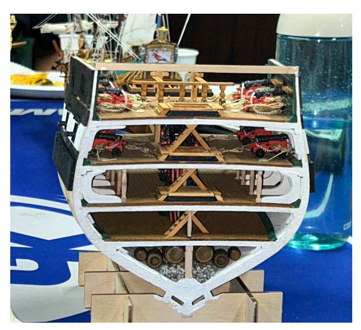
Fig. 13. Jim Tortorici's USS Constitution cross-section nearly finished.