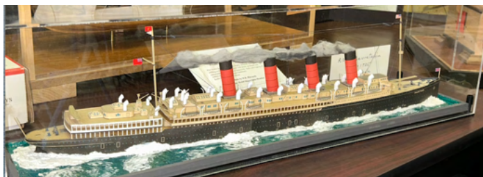
Fig. 9. Above-Model of Ocean liner, Mauretania by George Sloup. Below-Model of Swedish Gunboat by Walter Hlavacek,.