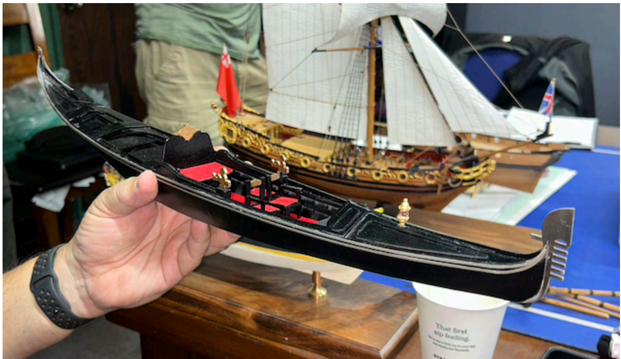
Fig. 15. Clare Hess's nearly complete Venetian Gondola .