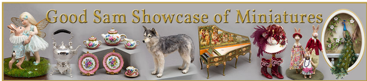
Fig. 5. Sample items from the Good Sam Showcase of Miniatures . (Good Sam Showcase of Miniatures)

We will have our annual exhibition of SBMS ship models at the Good Sam Showcase of Miniatures (Fig. 5) on October 12 and 13 . As previously, the convention will be held at the: