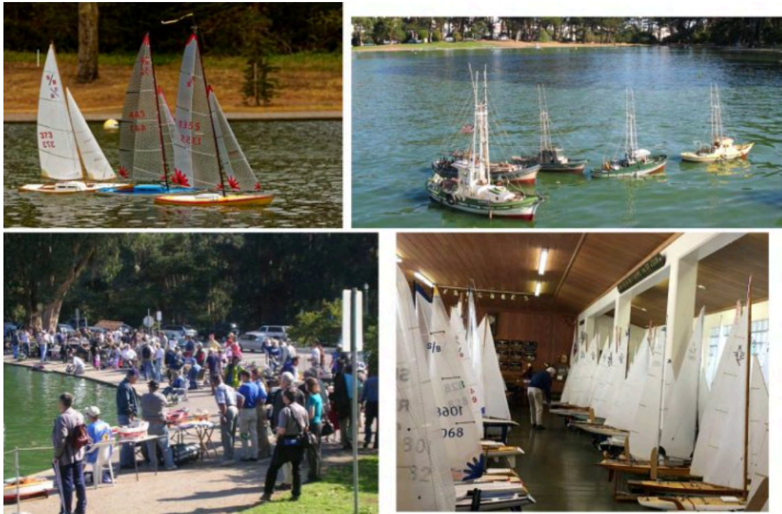
Fig. 3. SFMYC activities on Spreckels Lake in Golden Gate Park .