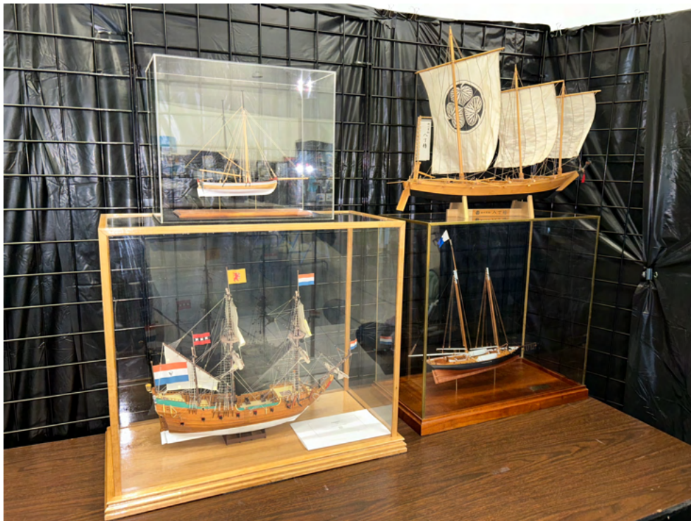
Fig. 7. Models by Clare Hess and George Sloup. Identifications below.