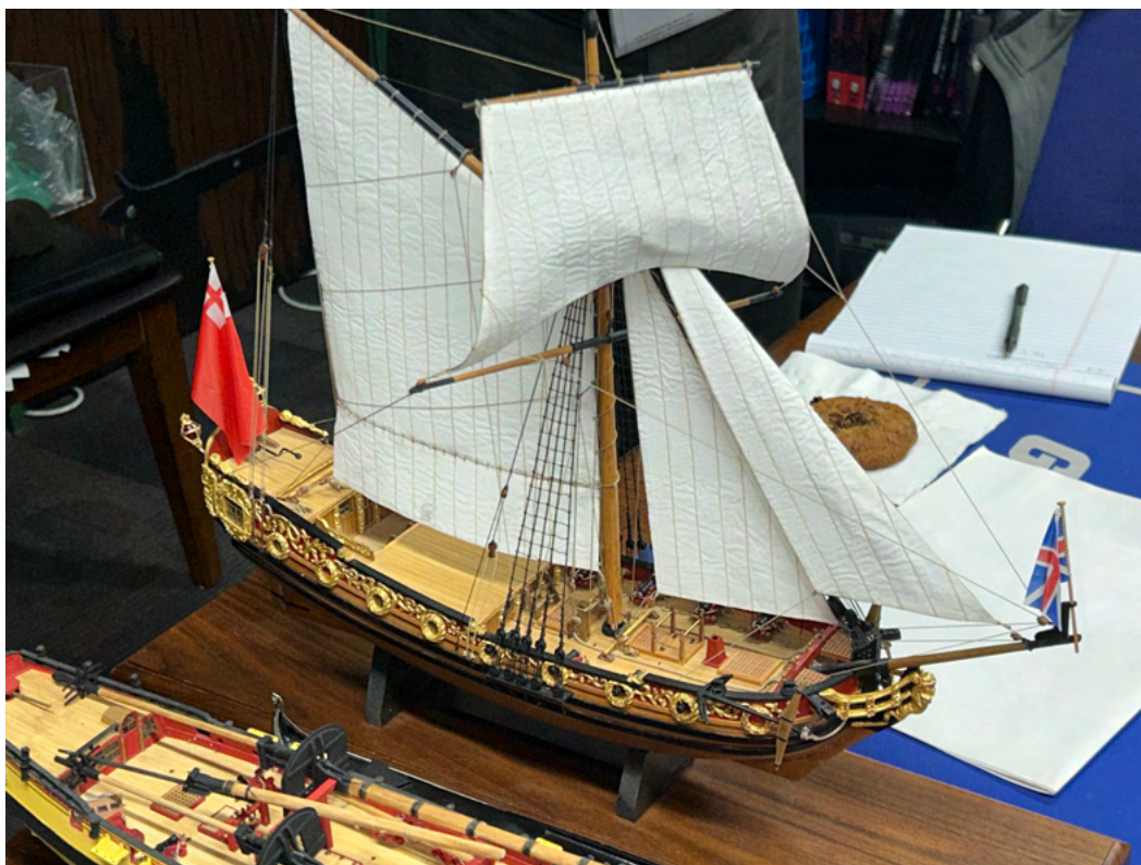
Fig. 13. Clare Hess's Charles Royal Yacht with full suite of sails now installed.