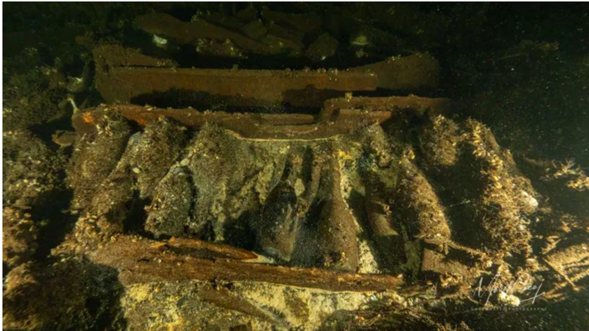
Fig. 11. Intact bottles of champagne found in the cargo hold of a 170 years old ship wreck found off the coast of Sweden near the island of Öland.

Given the past value of such a cargo, it has been speculated that it was meant for the table of a Russian Tsar, who at that time was either Nicholas I or Alexander II . It is reported that one of the former's cargo ships was lost in the area in 1852.