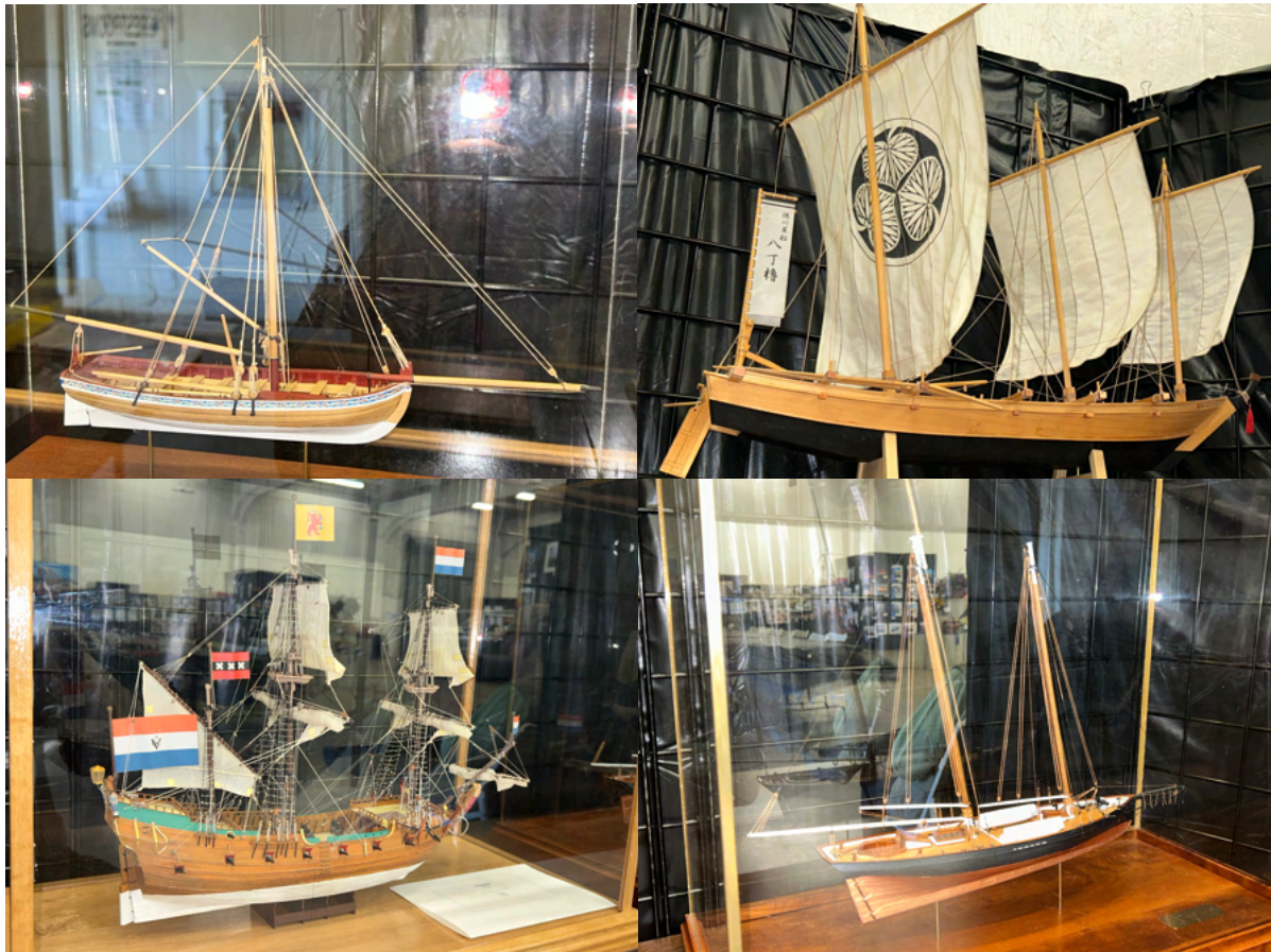
Fig. 8. IDs of models from Fig. 7. Models by Clare Hess: Upper left- Medway Longboat , Upper right-Japanese Hacchoro fishing boat, Lower right-New York Pilot Boat, Mary Taylor , Model by George Sloup: Lower left-Dutch 17 th Century fluyt, Papegojan .