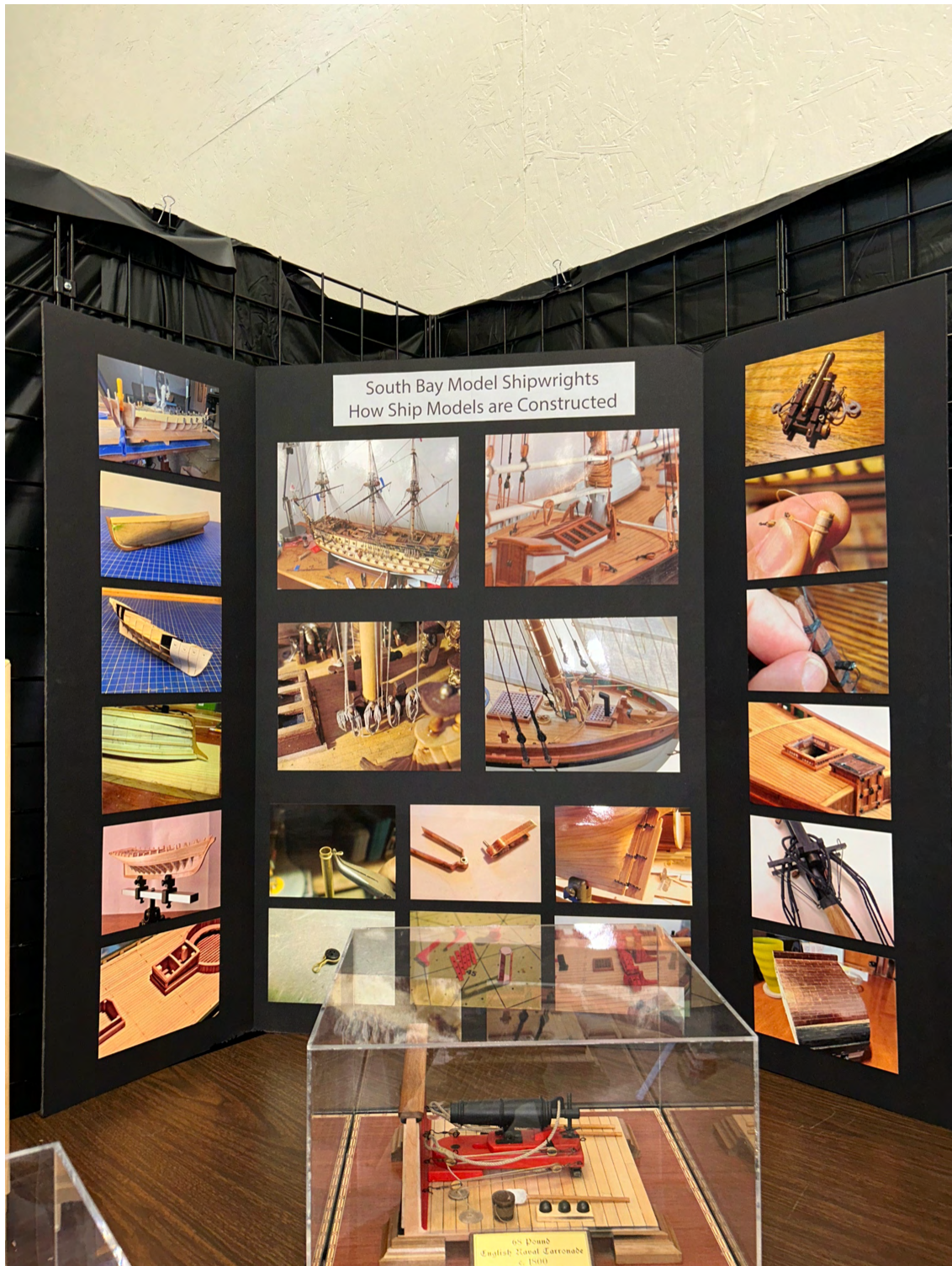
Fig. 10. Instructional SBMS poster about ship modeling with the Carronade battle station by Ken Lum below.

Our exhibition will continue through August 1-4 as noted above.