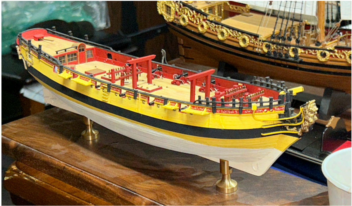
Fig. 14. Clare Hess's card model of HMS Wolf .