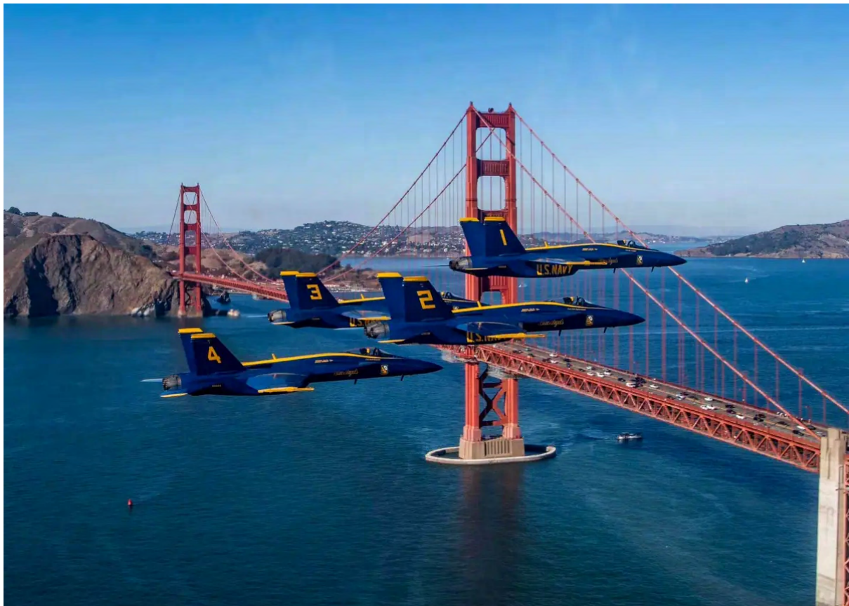
Fig. 4. The Blue Angels flying over the Golden Gate Bridge.