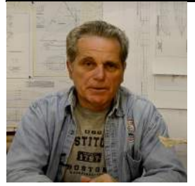
Blocks Not from Scratch, Part 1:

https://www.youtube.com/watch?v=MS6l8gLD984&t=4s