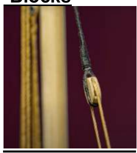
Blocks Not from Scratch, Part 1:

https://www.youtube.com/watch?v=MS6l8gLD984&t=4s