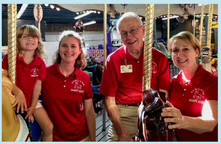
4 Generations of Funland family members working together!