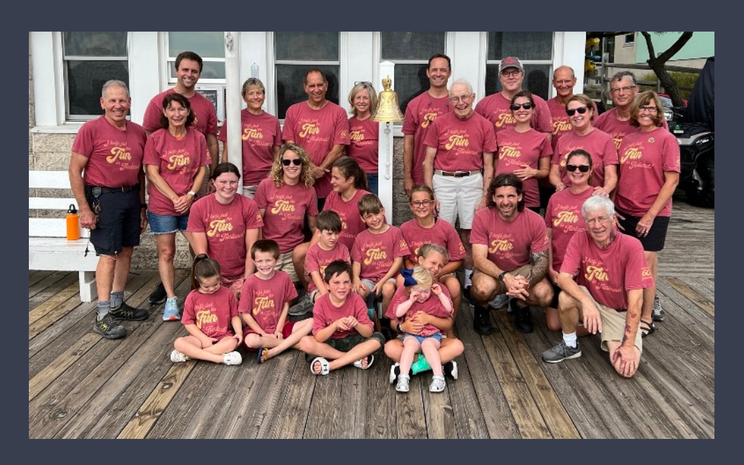
Some of the Funland family members that work with you during the summer!

Funland employees are more than just an employees. When you work with our family, we want you to feel like part of our family.