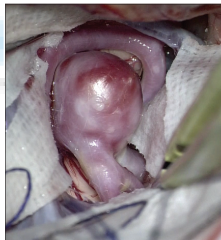
Figure 2: Intraoperative image of the same aneurysm with thinned wall