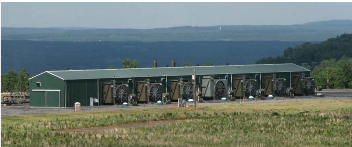
SWN CONSTRUCTS BUILDINGS around compressor equipment to lower sound levels. Many of our large compressor stations currently have buildings around them.

The Environmental Protection Agency (EPA) recommends a maximum 24-hour continuous sound-level exposure of 70 dB. The Occupational Health and Safety Administration (OSHA) has mandated a maximum limit of 90 dB for eight hours of continuous sound exposure without hearing protection.