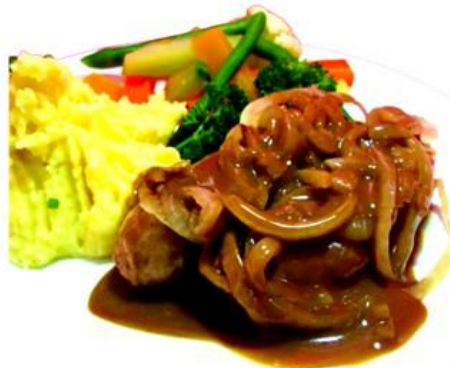
Pork Bangers 495 2 ENGLISH PORK BANGERS OR CUMBERLAND SAUSAGES COVERED IN GRILLED ONIONS & SERVED WITH GRAVY & 2 SIDES