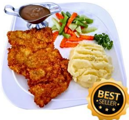
Pork Schnitzel 495 JUICY AND FLAVORFUL PORK TENDERLOIN CUTLET WITH A CRISPY CRUMBED COATING THAT WILL HAVE YOUR MOUTH WATERING - SERVED WITH 2 SIDES LEMON & GRAVY