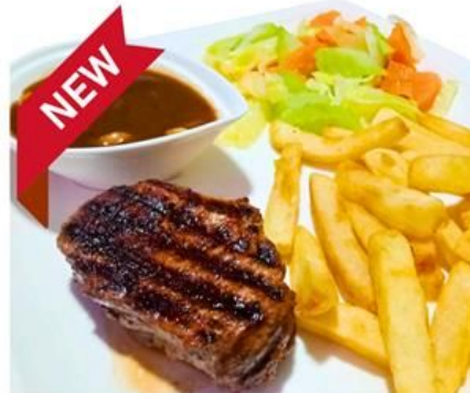
Tenderloin Steak 950 OUR THICK CUT 250GM GRILLED BRAZILIAN TENDERLOIN STEAK IS SERVED WITH YOUR CHOICE OF 2 SIDE DISHES & PEPPER, MUSHROOM OR PLAIN GRAVY