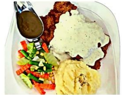
Country Fried Steak 495 AMERICAN COMFORT FOOD - BREADED & SEASONED BEEF BRISKET COVERED IN YOUR CHOICE OF CREAMY PEPPER, ONION OR MUSHROOM GRAVY & SERVED WITH 2 SIDE DISHES

SAUCES — PLAIN GRAVY, ONION, MUSHROOM, PEPPER OR GARLIC