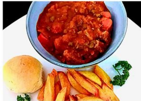
Beef Stew 470 TENDER SLOW COOKED BEEF CHUNKS & VEGETABLES COMBINED IN A HOT POT STEW SERVED WITH RICE OR ANY SIDE DISH POTATO