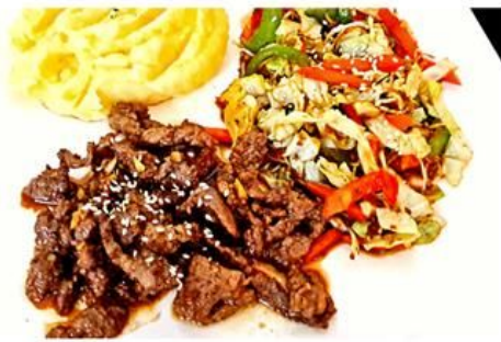
Mongolian Beef 430 BEEF STRIPS STIR FRIED IN A MONGOLIAN SWEET & SAVORY BBQ SAUCE SERVED WITH YOUR CHOICE OF MASHED POTATO OR RICE