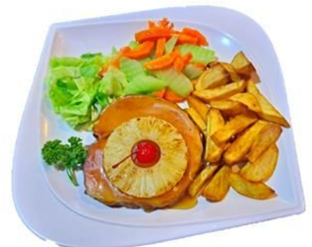
HAWAIIAN HAM STEAK 495 A THICK CUT PORTION OF CURED HAM STEAK COVERED IN A HAWAIIAN HONEY GLAZE, TOPPED WITH GRILLED PINEAPPLE AND SERVED WITH 2 SIDE DISHES

GCash DELIVERY / TAKE AWAY - 09070976888 &