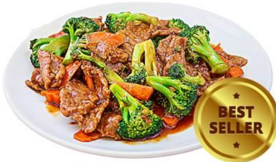
Beef & Broccoli 395 STIR FRIED BEEF MIXED WITH FRESH BROCCOLI IN AN OYSTER SAUCE WITH VEG AND SERVED WITH RICE OR MASHED POTATO