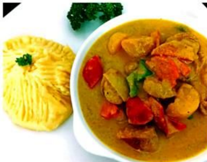
Curried Pork Sausages 450 THICK SLICED PORK SAUSAGES SIMMERED WITH VEGETABLES IN A MOUTH WATERING HOMEMADE CURRY GRAVY SERVED WITH RICE OR ANY SIDE DISH POTATO