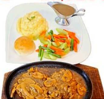
2 Salisbury Steaks 495 2 WELL SEASONED SALISBURY STEAKS SERVED ON A SIZZLING HOT PLATE COVERED IN MUSHROOM GRAVY WITH 2 SIDE DISHES