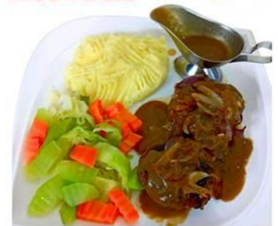
Beef Rissoles 450 2 LARGE BEEF RISSOLES SERVED WITH GRILLED ONIONS & ANY SAUCE YOU LIKE & 2 SIDE DISHES