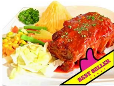
BBQ Baby Back Ribs 650 OUR SLOW-COOKED AND PERFECTLY SEASONED, BABY BACK PORK RIBS ARE COVERED IN OUR SWEET AND SMOKEY BUNNY BBQ SAUCE. ONE OF OUR BEST SELLERS!