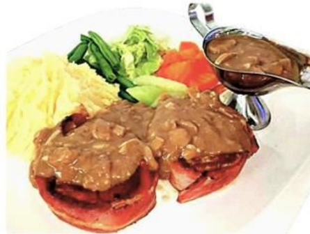
Pork Medallions 520 2 BACON WRAPPED PORK TENDERLOINS GRILLED TO PERFECTION AND COVERED IN A HEARTY MUSHROOM & GARLIC GRAVY. SERVED WITH 2 SIDE DISHES