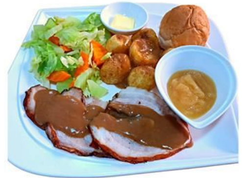
Roast Pork Dinner 495 SLOW ROASTED SEASONED PORK SERVED WITH 2 SIDE DISHES, APPLESAUCE, GRAVY AND A FRESH BUNNY BAKERY DINNER ROLL