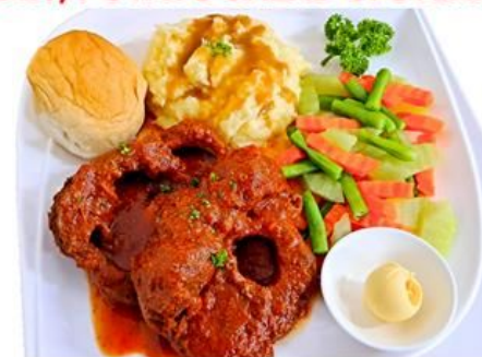
Beef Osso Buco 520 SLOWLY BRAISED BONE IN BEEF SHANK CAMELIZED & BASTED IN A TOMATO & HERB BASE - SERVED WITH 2 SIDES