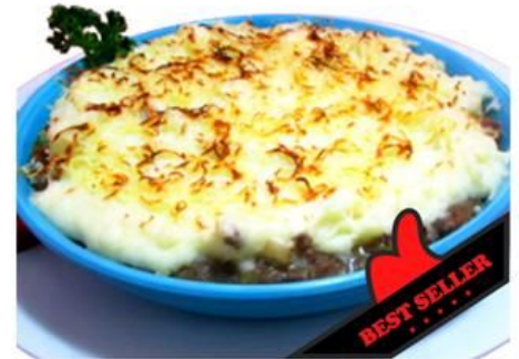
Cottage Pie 395 THIS AUSSIE / ENGLISH CLASSIC HAS A SAVOURY BEEF MINCE, VEGETABLES & GRAVY FILLING TOPPED WITH MASHED POTATO & MELTED CHEESE