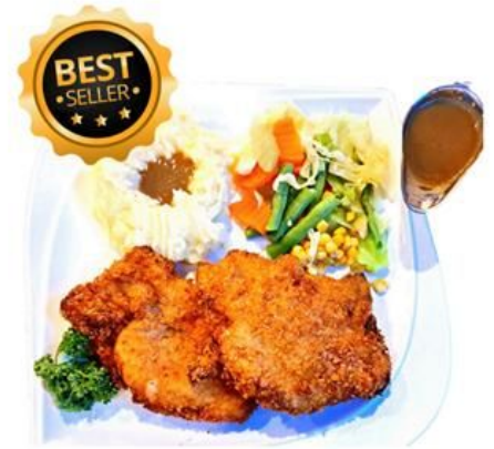
CRUMBED PORK CHOPS 520 2 PORK CHOPS COATED IN A FLAVORFUL BREAD CRUMB MIXTURE THEN FRIED UNTIL CRISP ON THE OUTSIDE BUT TENDER AND JUICY WITHIN - SERVED WITH GRAVY & 2 SIDES