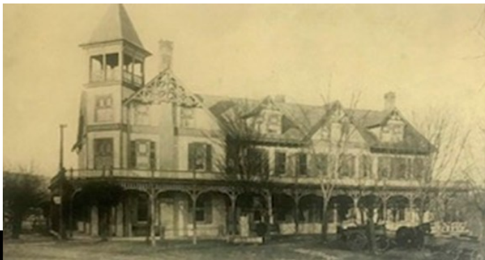
The original Black Bear Inn as it appeared in 1849. George Meiser IX