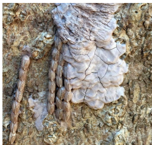
A SPOTTED LANTERNFLY EGG MASS

The spotted lanternfly (SLF) adults have laid their eggs on any surface they may find, including trees, rocks, side of a building and cement blocks. Through the winter months, egg scraping or smashing eggs remains the management option for controlling the spread. The Department of Agriculture recommends removal of the egg masses by scraping them into a bag or container with rubbing alcohol or hand sanitizer and throwing it in the trash. An easier method would be to crush the egg mass. A wallpaper seam roller works well crushing the egg masses. To assist in identification, below are pictures of the SLF egg masses. The eggs are covered by wax when first laid, with the wax looking light gray, but dries to a mud like appearance.