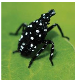
Early nymph (actual size = 1/8") Found late April-July.