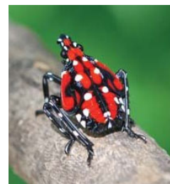
Late nymph (actual size = 1/2") Found July-September.

https://www.stlawboro.com/spotted-lanternfly.html