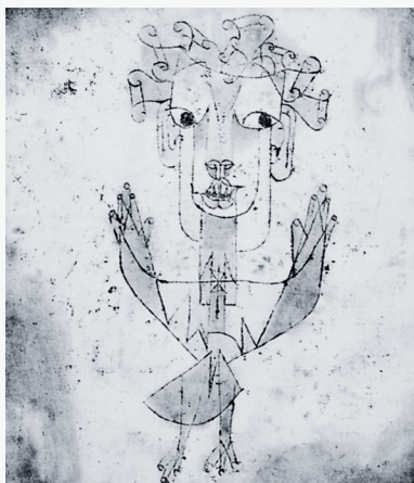
Nova Angelus by Paul Klee