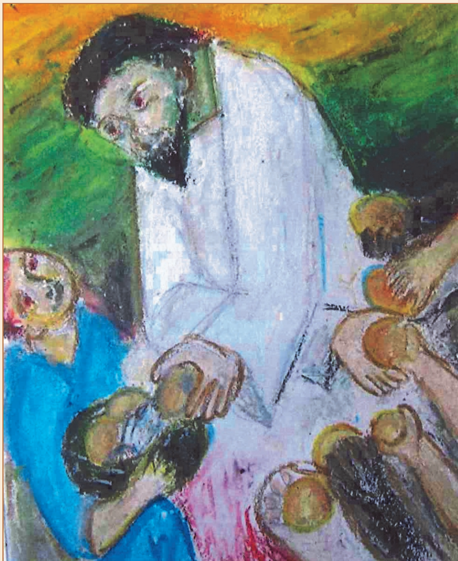
Miracle of five loaves and two fish

Weekly Masses: Saturday 4:30 & Sunday 9:30 Sacrament of Reconciliation: Saturday 3:45