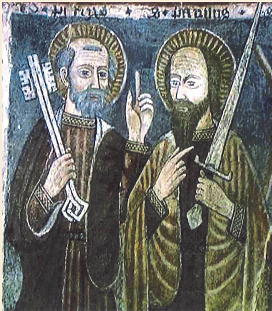
Saints Peter and Paul

Weekly Masses: Saturday 4:30 & Sunday 9:30 Sacrament of Reconciliation: Saturday 3:45