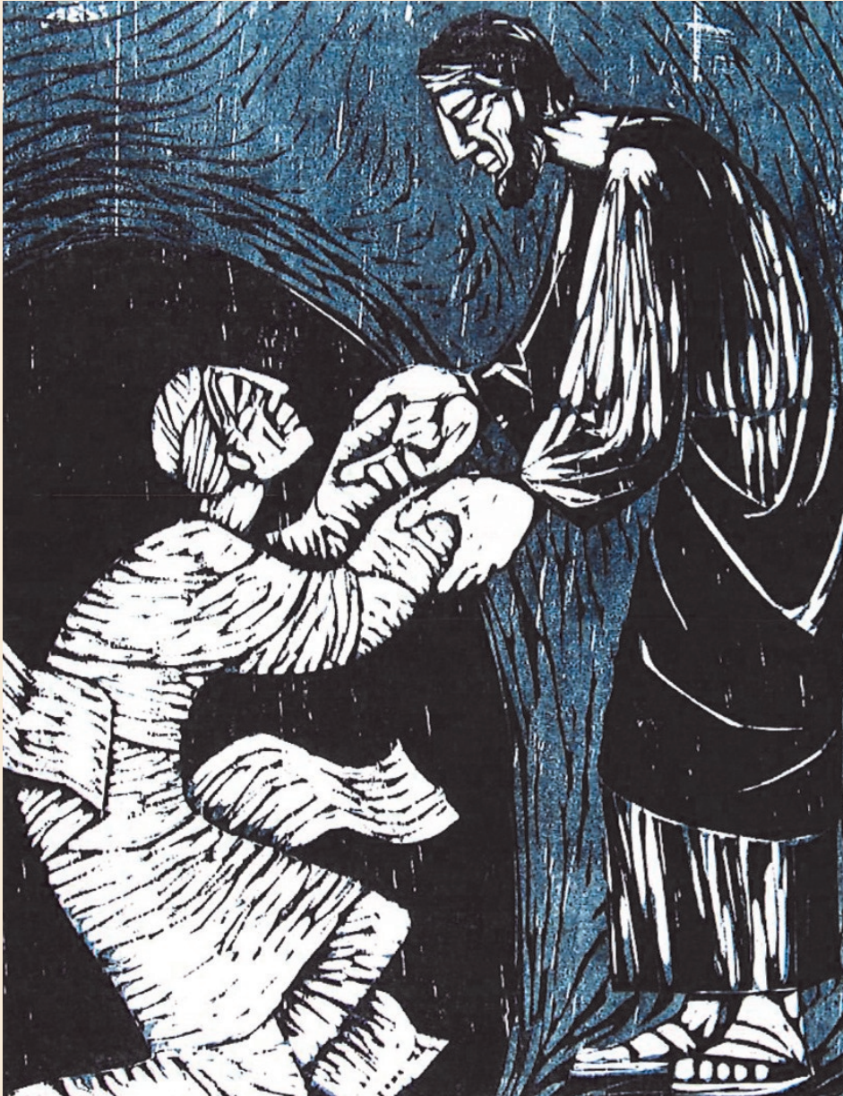
Raising of Lazarus

Weekly Masses: Saturday 4:30 & Sunday 8:15 & 10:00 Sacrament of Reconciliation: Saturday 3:45