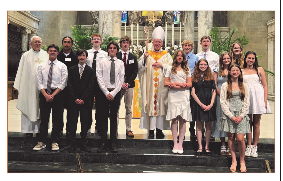
Our Confirmandi received the Sacrament of Confirmation at the Basilica on Saturday, April 26th.

Congratulations to our Sacramental Preparation Groups