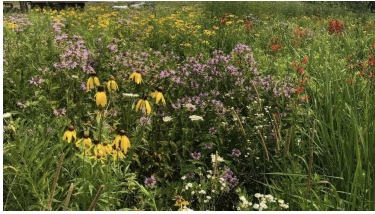
Prairie coneflower, wild bergamot, and royal catchfly in peak bloom