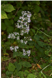
Blue Heart-leaved Aster