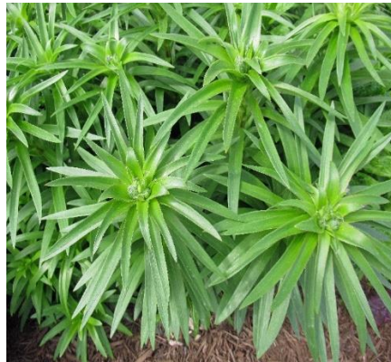
(Stay tuned for the blooms of June)

LOOK AT HOW THE MAY FLOWERS GROW, SO GROWS THE RWWC MEMBERSHIP!