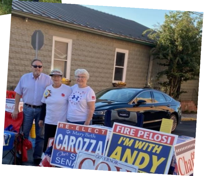
First Friday in Snow Hill