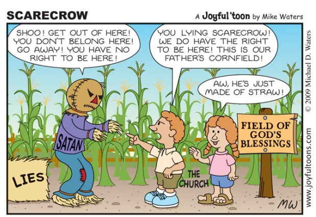
Do not be afraid, little flock, for your Father has been pleased to give you the kingdom. $-{\rm Luke}\,12{:}32\,{\rm NIV}$

Brunch will be served, Decorated Cookies, Baked Goods, Crafts, Christmas Booth, Celebrative Baskets for various occasions, and much more!