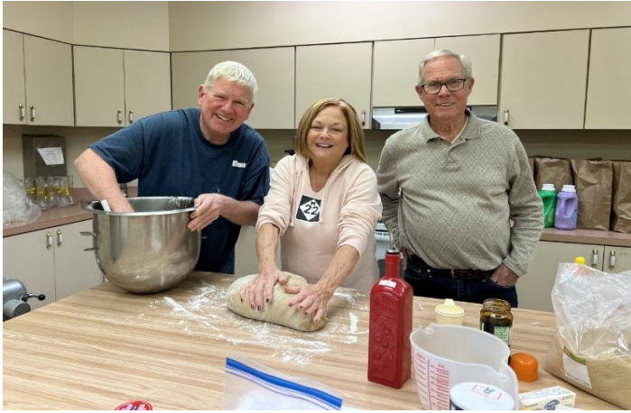
Preparing for the Swedish Rye Bread Sale