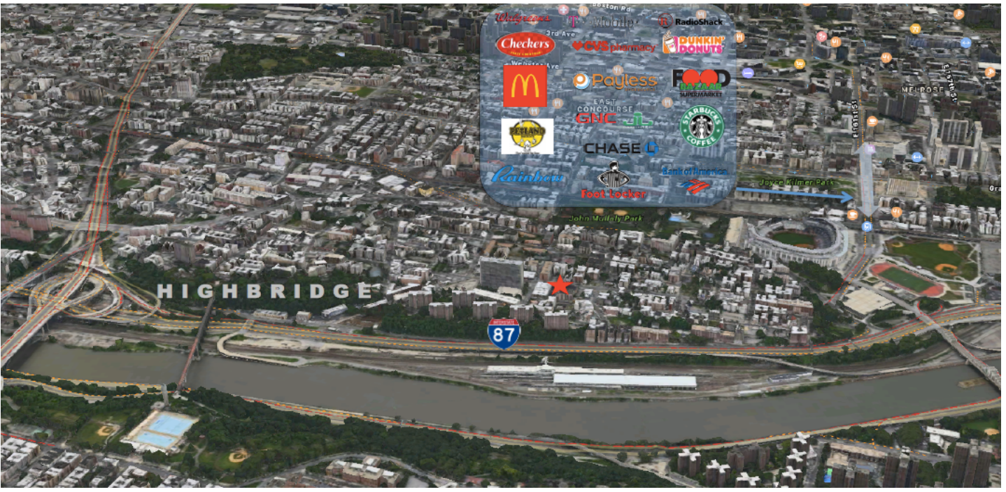
No warranty or representation, express or implied, is made to the accuracy or completeness of the information contained herein, and same is submitted subject to errors, omissions, change of price, rental or other conditions, withdrawal without notice, and to any special listing conditions imposed by the property owner(s). As applicable, we make no representation as to the condition of the property (or properties) in question.

Note: All square footage calculations & measurements are approximate and must be independently verified.