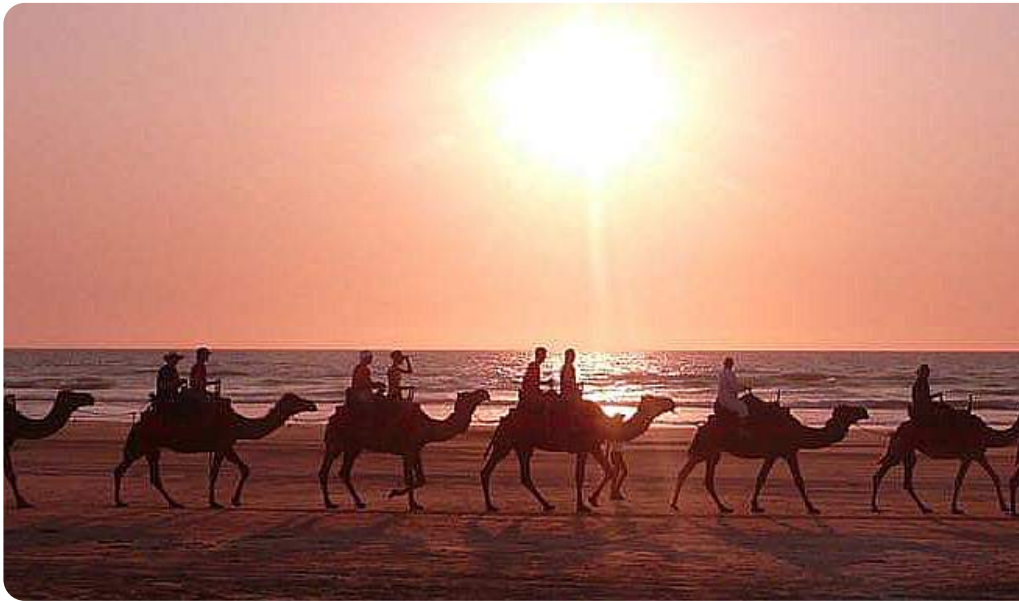
Cable Beach Broome, Western Australia