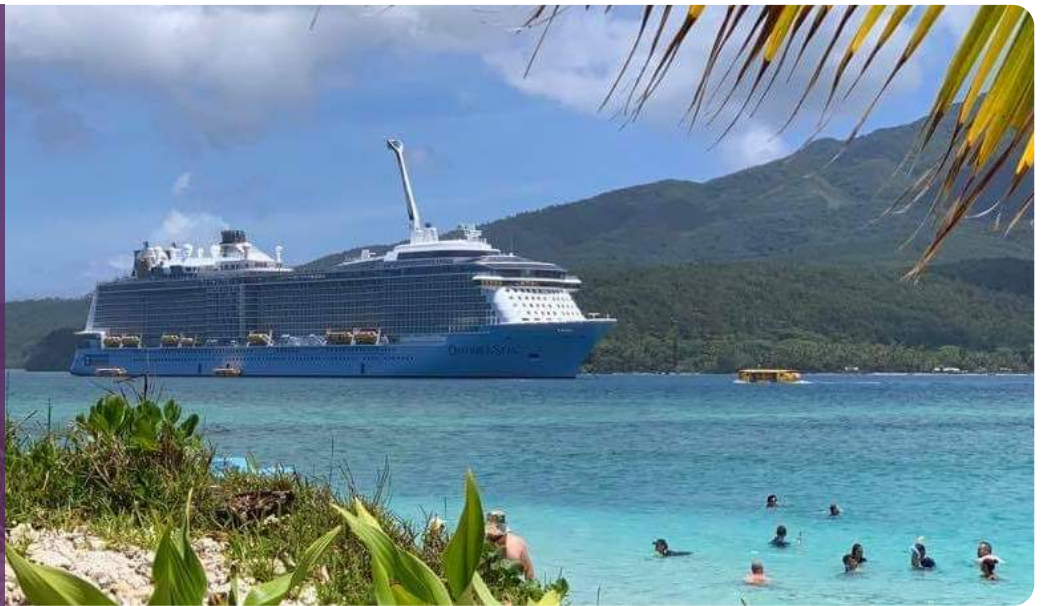
Ovation of the Seas, Mystery Island, Vanuatu