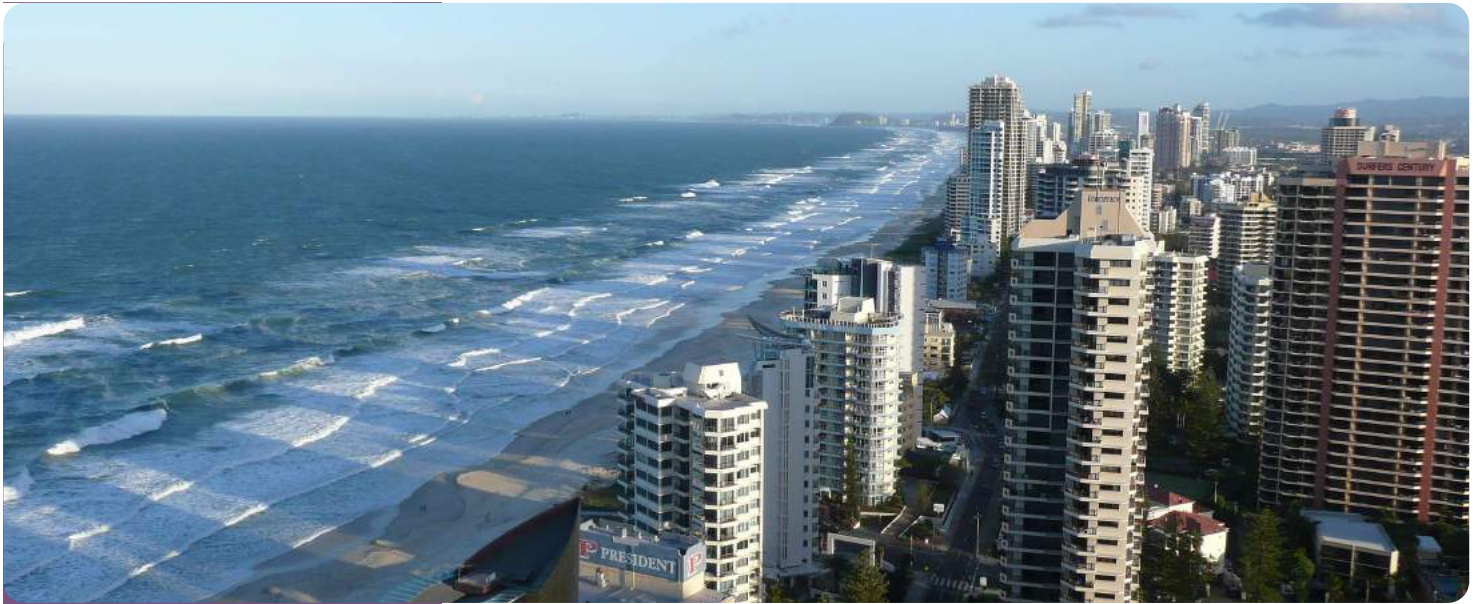
Gold Coast, Queensland