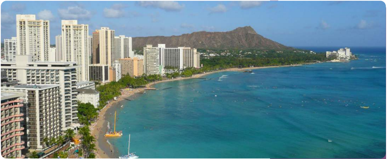
Honolulu, Hawaii, USA