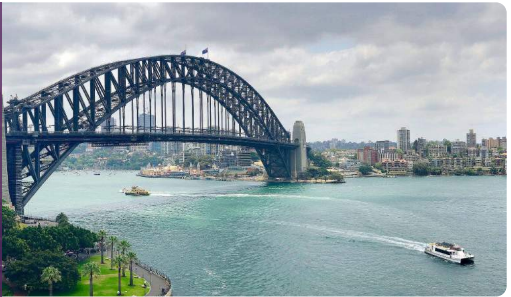
Sydney Harbour Bridge, New South Wales