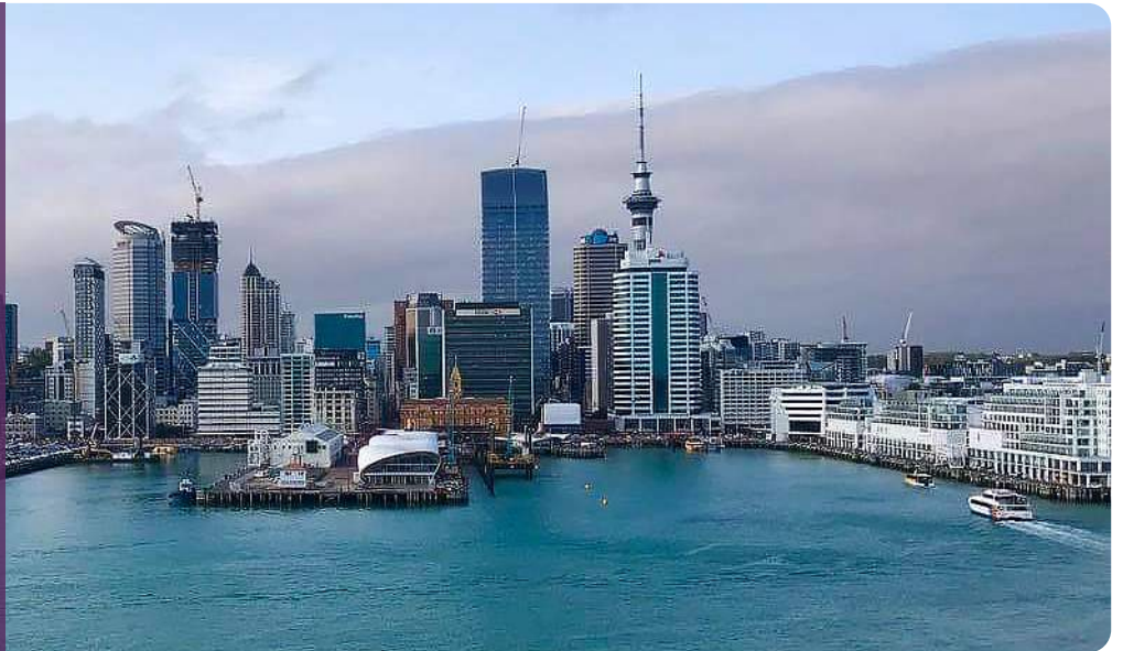
Auckland, New Zealand