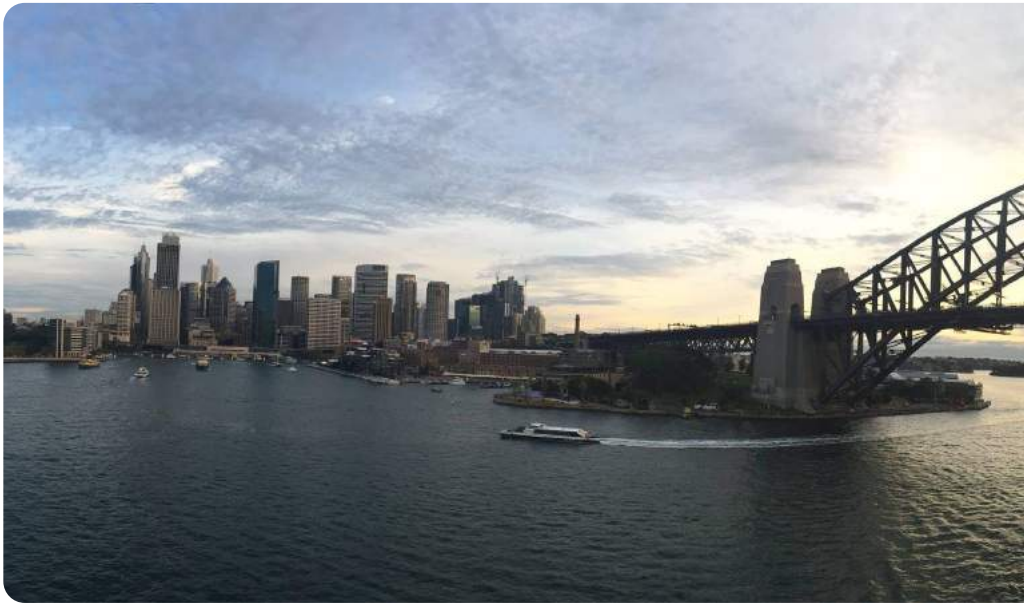
Sailing out of Sydney Harbour