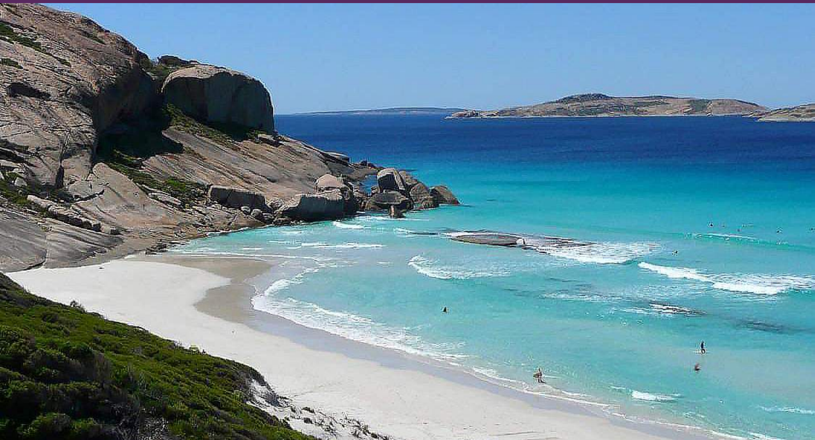
Esperance, Western Australia