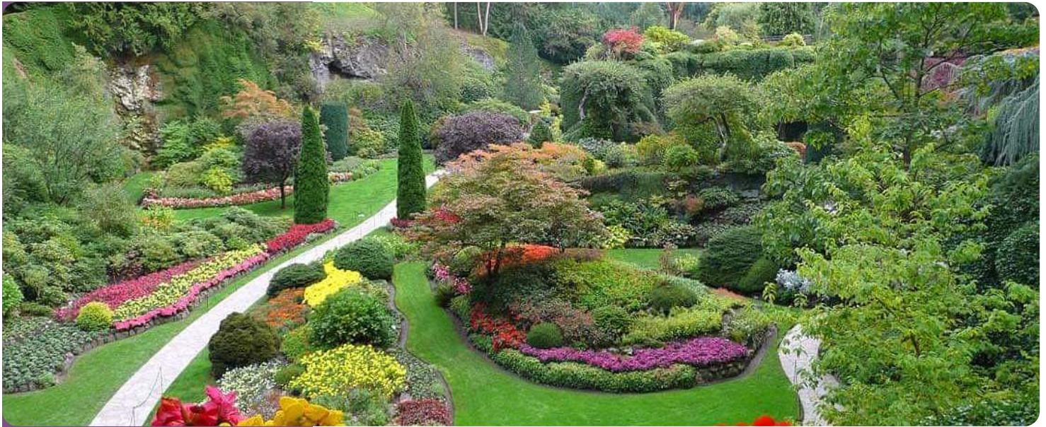
Butchart Gardens, Canada