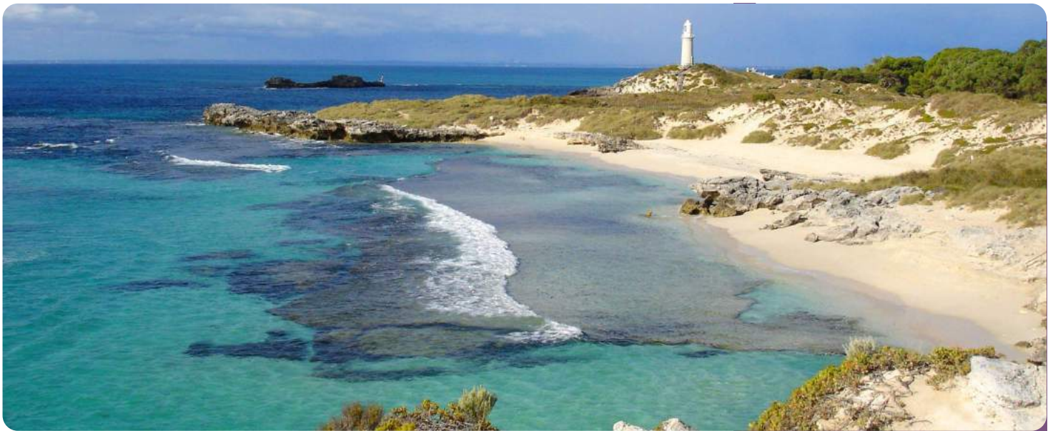
Rottneest Island, Western Australia