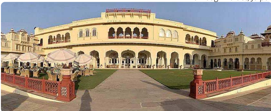
Rambagh Palace, Jaipur

Booking with us you're not only saving $$ , you're also getting extra benefits . Next time you're looking to travel, please drop me an email and I can check whether I can do better than what you've seen.