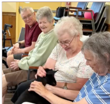
A friendly visitor