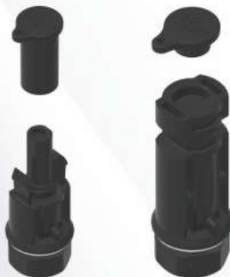
Dust Protection Cap for PV Panel Connector