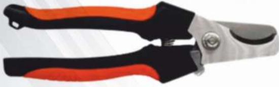
DC Cable Cutter