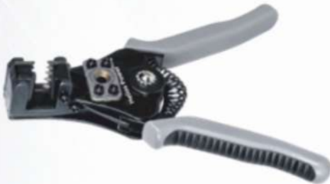
Cable Stripping Tool