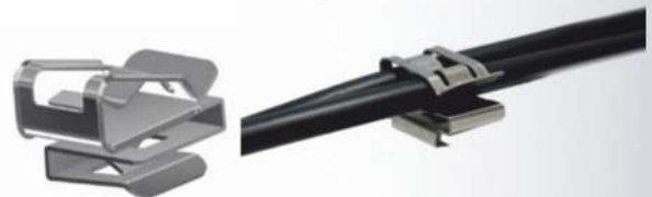
90° & 180° Solar DC cable clip