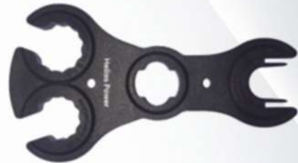
Opening and Tightening Tool for HP-A4 Max Series