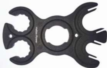
Opening and Tightening Tool for Inline Fuse HP-A6 Max Series