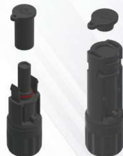
Dust Protection Cap for PV Straight Connector