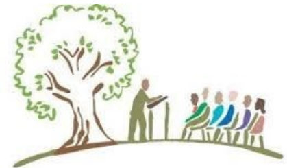
Outdoor Worship Service

These are blended services . Bring a comfy lawn chair or enjoy the summer breeze on one of our benches or picnic tables. If you're more comfortable or your health requires, stay in your car. Drive-in Worship will be set up too, listen from within a 1-mile radius on 89.5 FM.