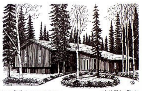
Lord of Life Lutheran Church