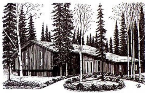
Lord of Life Lutheran Church