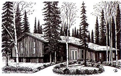
Lord of Life Lutheran Church North Pole, Alaska