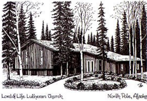
Lord of Life Lutheran Church North Pole, Alaska